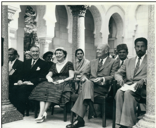
Below Left: President and Mrs. Eisenhower at 1957 dedication ceremony, June 28, 1957.