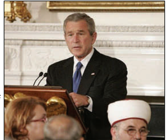
President Bush at Iftaar Dinner, October 17, 2005.

President Bush's speech at Iftaar Dinner October, 17 2005