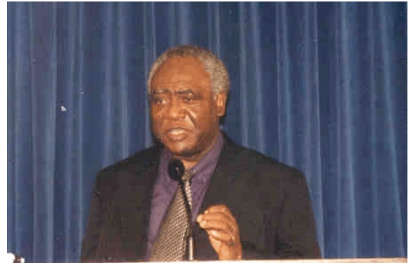
Congressman Davis speaking to Town Hall meeting on immigration.

One of the biggest, most complex and most passionate issues facing Americans today is the issue of immigration. In order to better understand where residents of the 7 th Congressional District stand, I held a town hall meeting on June 1 at the Maywood Village Hall where a very heated and passionate discussion took place.