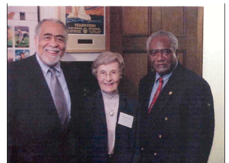
Congressman Davis meets with constituents in his D.C. office to discuss TANF Re-Authorization

During the meeting, free health screenings will be offered. To pre-register, and for additional information, please call 773-533-7520. I look forward to seeing you at Malcolm X College on September 6 th and 7 th !