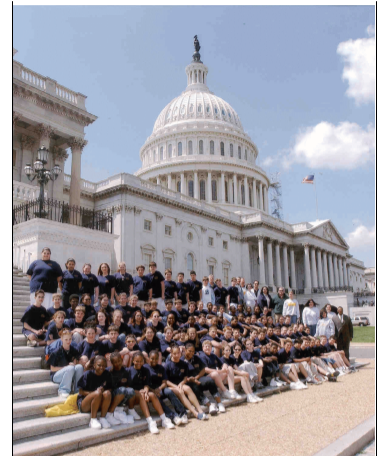
Westchester Middle School

Many of you, especially school groups, have been able to visit the office in Washington, D.C. I hope you continue to feel welcome in both our Chicago and Washington offices. I am opening an additional office to better serve the suburban portion of the district. It will be located at 1030 17 th Avenue in Maywood, Illinois and will be opening in August.