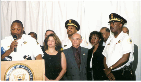
Press conference announcing the Curfew Awareness Program and Initiative to Reduce Juvenile Crime

Building on discussions which took place in my Public Safety Advisory Task Force, and working with law enforcement officials, agencies serving youth, community organizations, and the media, a curfew awareness effort to help curb youth crime and reduce juvenile delinquency has been launched. This program is proving to have widespread appeal and should go a long way towards helping to keep our young people off the street and engaged in meaningful activities. I have consistently supported legislative initiatives and funding efforts to support programs with these objectives. I will continue to seek additional legislation and resources to combat juvenile crime and offer positive alternatives.