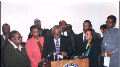
Congressman Davis announcing the introduction of the Ex-Offender Self-Sufficiency Act of 2002

As a result of increases in drug use and get-tough-on-crime policies of the '70s, '80s and '90s, such as mandatory minimum sentencing, zero tolerance, sentencing disparities, "three strikes and you're out" laws, and other initiatives, record numbers of people were arrested, convicted and given long sentences to serve in prison. Now these individuals are being released in large numbers back into society without preparation for normal life.