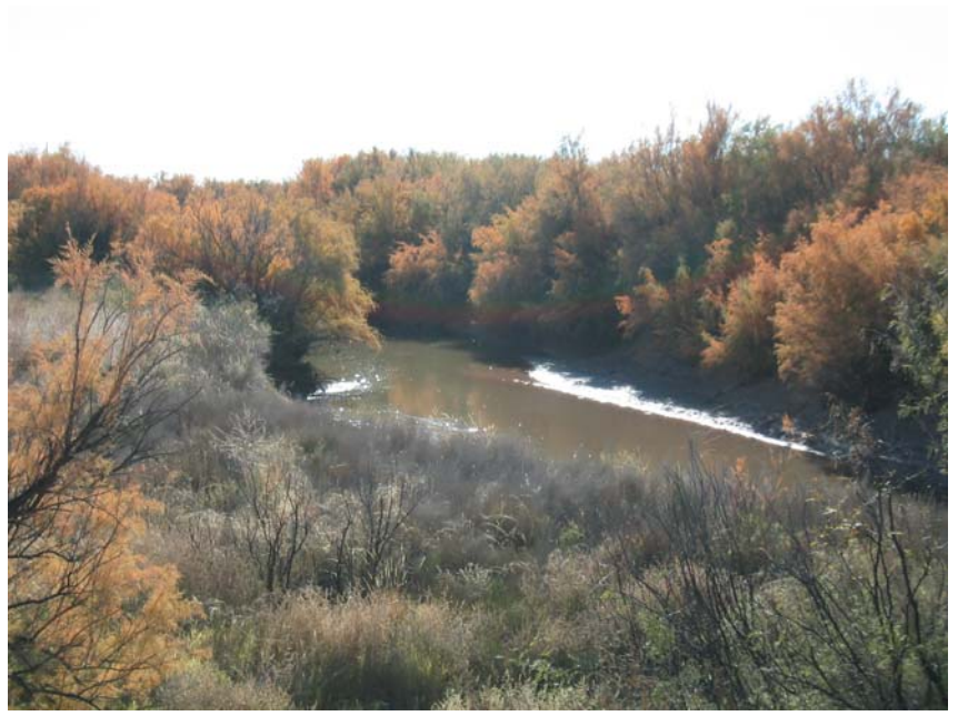
Pecos River by pumping locations -November 2006