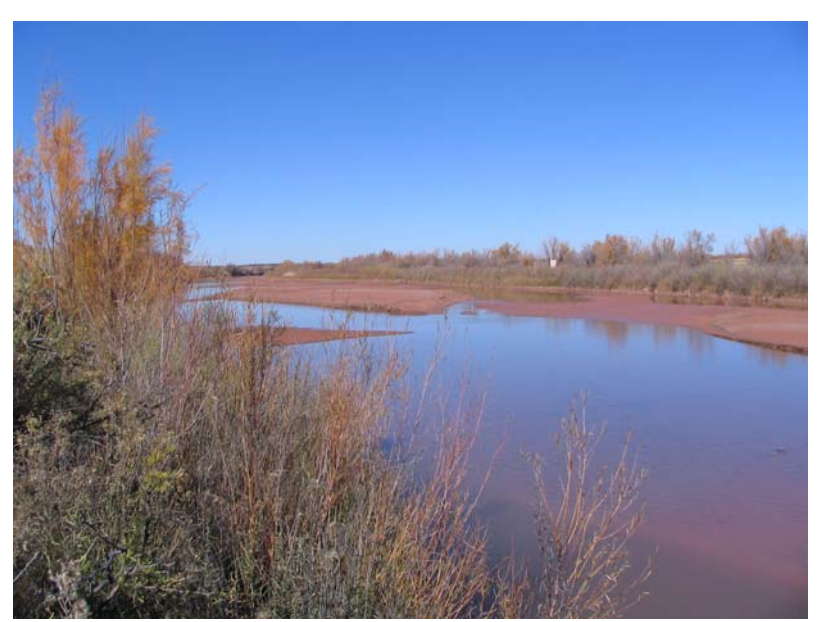
Pecos River in November 2006

This report describes the actions taken in the calendar year from the date of the BiOp and the ROD, August 1, 2006 through December 31, 2006 and future recommendations which are in the AMP report for monitoring and river management for 2007.