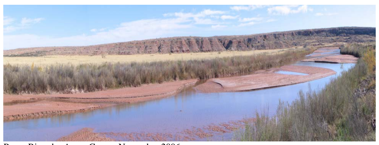
Pecos River by Acme Gage – November 2006