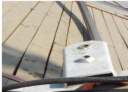
Photo 5 - The receiver assembly where the pin is inserted

The NIOSH Fire Fighter Fatality Investigation and Prevention Program is conducted by the National Institute for Occupational Safety and Health (NIOSH). The purpose of the program is to investigate fire fighter line-of-duty-deaths and formulate recommendations for preventing future deaths and injuries. The program does not seek to determine fault or place blame on fire departments or individual fire fighters but to learn from these tragic events and prevent future similar events. For more information, visit the program website at www.cdc.gov/niosh/fire or call 1-800-CDC-INFO .