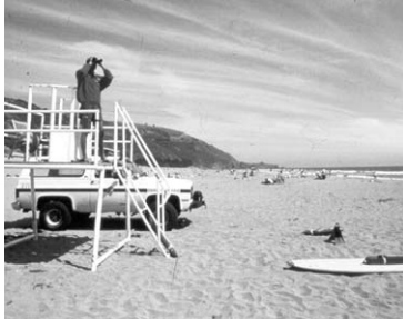
Stinson Beach lifeguards are on duty from late May to mid-September.