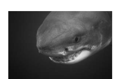
Great White Sharks attacks are known to occur at Stinson Beach. Please refer to the signs for more information.