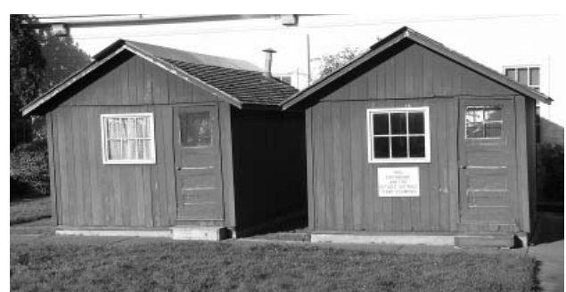
Refugee cottages on the Presidio today

camps into small tent towns, where people quickly established the routines of everyday life; children formed playgroups, and dining halls and camp fires became the center of social gatherings. The camps on the Presidio were the first to dismantle, closing in mid-June. Most refugees moved out as the city rebuilt, while others were housed more permanently in small wooden Earthquake cottages. By 1908, these camps were disbanded as the cottages were moved onto the owners' private property, providing the opportunity for many to own their first homes. The crisis was over.