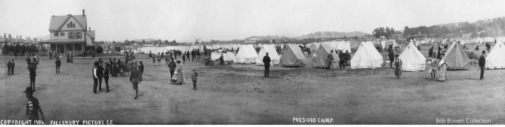
View looking north from the largest Presidio refugee camp near the site of Letterman Hospital