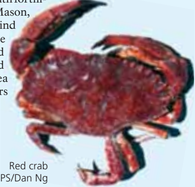
Red crab

Muir Beach Overlook This site of a former U.S. Army coastal observation post (base end station) has spectacular coastal views. Watch migrating whales in winter. Picnic area. 415-388-2595.