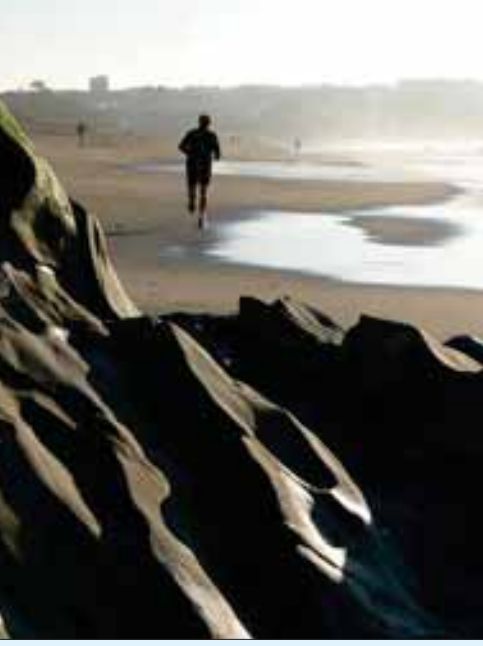
Baker Beach enclosed within the San Francisco cityscape, is a place of refuge, reflection, and recreation.

Cliff House This has been a tourist destination since the first Cliff House was built in 1863. Today's Cliff House, built in 1909, is the third to occupy the site. The Victorian-era resort complex includes nearby Sutro Baths and the restored Sutro Garden. 415-561-4323.