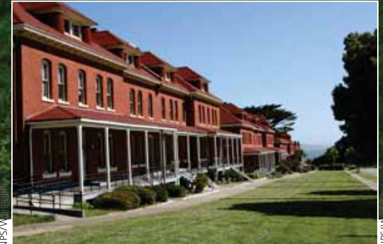
The Presidio's former enlisted men's barracks date from the 1890s. Along with echoes of San Francisco's military past, the Presidio has much to offer recreation lovers. Top: Golden Gate Bridge from Crissy Field.

Whether you are a visitor to the Bay Area or a lifelong resident, Golden Gate National Recreation Area offers you experiences you can find nowhere else. This national park area has some world renowned destinations—Alcatraz and Muir Woods, for example—as well as some places where you might not encounter another human being. Everywhere there are surprises, from the ridgetop where Spanish explorers first sighted San Francisco Bay to a Cold War-era missile site.