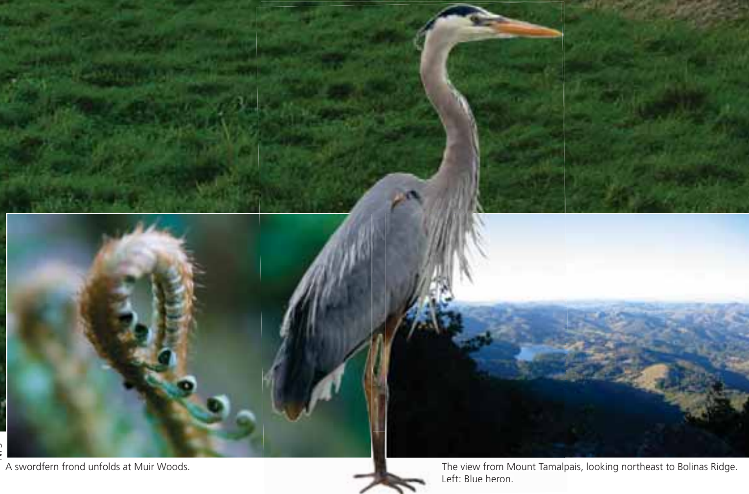
A swordfern frond unfolds at Muir Woods.