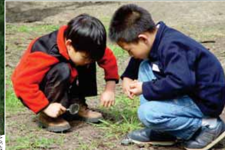
Young visitors examine the hidden world of Golden Gate. Activities for children and families are available at park visitor centers.