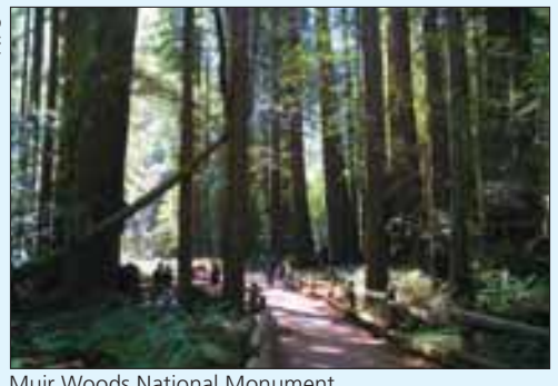
Muir Woods National Monument

Muir Beach This sheltered cove gives you a chance to relax and enjoy the coastal scenery. Varied hiking opportunities. Dangerous swimming conditions; no lifeguards. 415-388-2595.