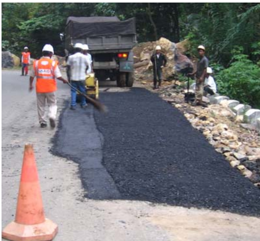
Workers repair sections of the U.S. road project along Aceh's West Coast.