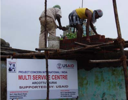
Workers in India renovating a building for use as a community center for informal learning, health clinics and community events.