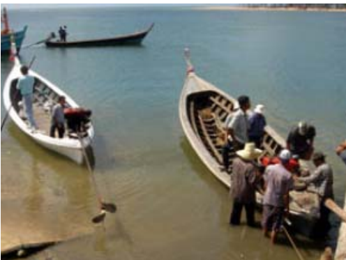
More than 90 percent of fishing boats in the affected region in Thailand were severely damaged or destroyed. USAID worked with local craftsmen to repair and rebuild traditional long-tailed fishing boats.