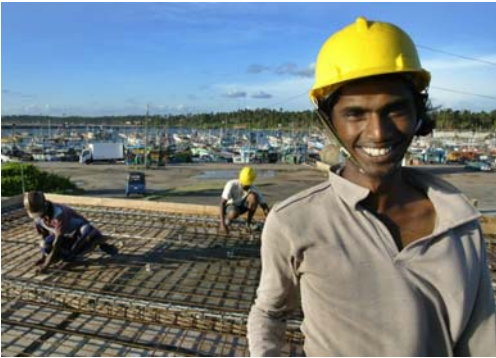
Sri Lankan construction workers helping to rebuild the Dondra Harbor