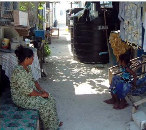
A Maldivian family at home on Naifaru island. Their water is supplied by a rain catchment system that feeds water into the black tanks.