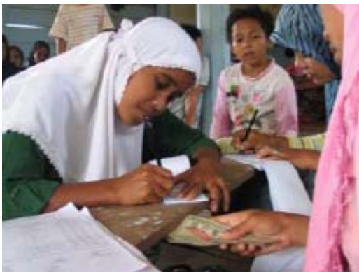
Acehnese women access credit to operate their businesses from USAID-funded livelihoods activities