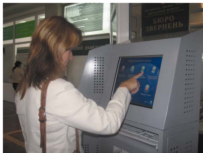
A visitor uses one of the E-government terminals installed in the Vinnytsya City Hall foyer.

E-government is a component of the city's Economic Development Strategic Plan, developed with help from USAID's Local Economic Development project. Citizens may now obtain full information on local government operations. From a home/office computer connected to the Internet, or terminals located in the City Hall foyer, one can access any non-confidential decision of the City Rada; send a request, application or complaint to any City Hall officer and monitor its progress online; apply to any department for an explanation or information, and then receive a reply by email or regular mail; or obtain information on hospitals, schools and institutions of culture.