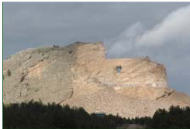
Crazy Horse Memorial was the first stop on the Thursday afternoon's sightseeing.