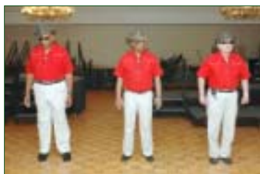
"The Blind Beat Dancers"

One of the highlights at the Creative Arts Festival every year is the great entertainment that comes in the shape of not one, but an ensemble of performers. The Festival brings out their best, allowing participants to fuse their creative energies into memorable performances.