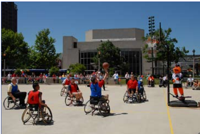
Roscoe, mascot for the Milwaukee Admirals hockey team cheers on the teams.