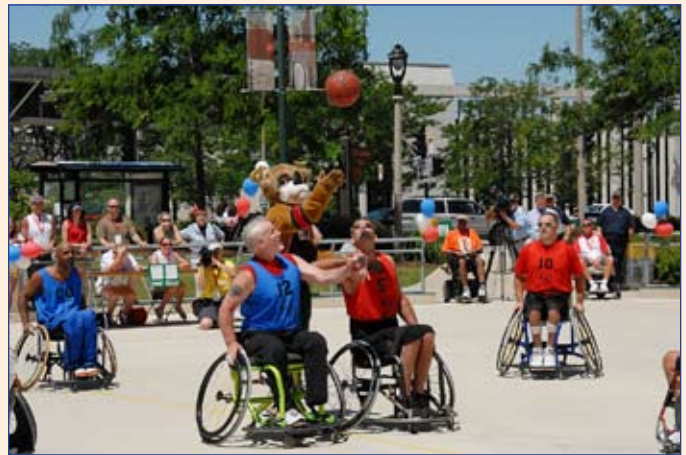
Bango, mascot for the Milwaukee Bucks, tosses the ball to begin the competition at the Kick-off.