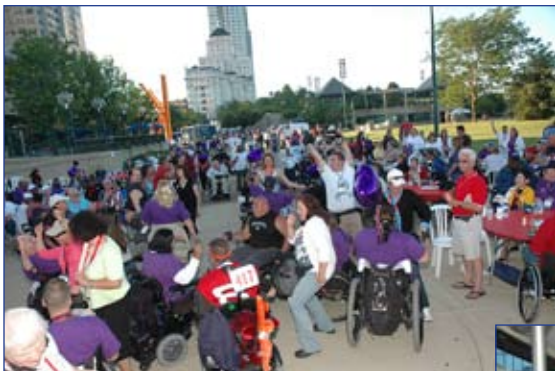
Doin' the Block Party boogie!

We wish you safe travels home and look forward to meeting you again next July in Omaha – so we can join in our Quest for the Best – together!