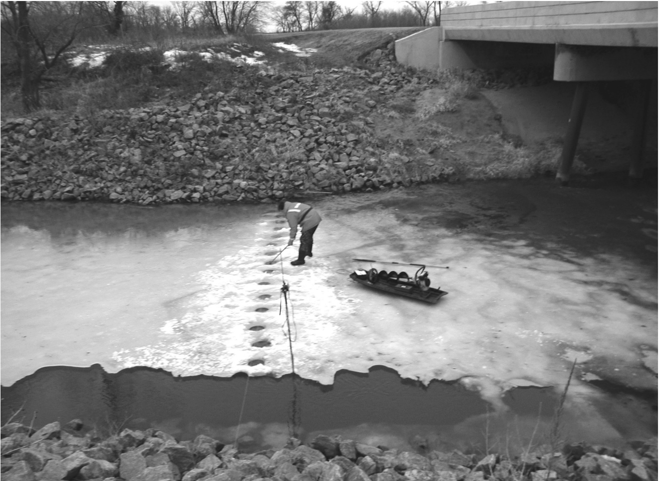
Measurement of streamflow through ice.