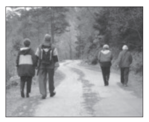
Sidewalks and pathways can enhance health outcomes in all age groups.

ners and academics has been particularly advantageous by keeping work and discussions visionary and broad, yet practical.