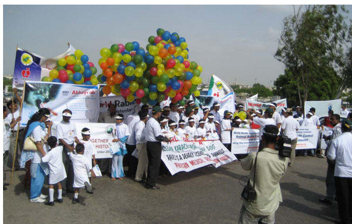
Rabies awareness walk in Pakistan.

Around the world, mass education and outreach events, such as a week-long celebration in Hisar, India, region-wide participation of 18 countries in Latin America, and national television broadcasts by the Nigerian Minister of Health helped educate more than 54 million people. And over 600,000 animals were vaccinated on and around World Rabies Day – an important step forward. CDC and its partners in the World Rabies Day team continue to foster a comprehensive approach of coupling education with dog vaccination to eliminate canine rabies and eradicate human rabies worldwide.