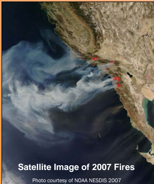
Satellite Image of 2007 Fires