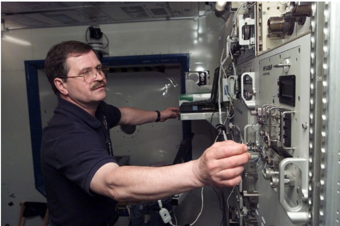
Cosmonaut Nikolai M. Budarin, Expedition 6 flight engineer, participates in Pulmonary Function in Flight (PuFF) nominal operations during Human Research Facility (HRF) training in the International Space Station (ISS) Destiny laboratory mockup/trainer at the Johnson Space Center's Space Vehicle Mockup Facility.

Little is known about how human lungs are affected by long-term exposure to the reduced pressure in spacesuits during spacewalks or long-term exposure to microgravity. Changes in respiratory muscle strength may result. The Pulmonary Function in Flight (PuFF) experiment focuses on the lung functions of astronauts both while they are aboard the International Space Station and following spacewalks. The crews of Expeditions 3 to 6 will test their lung capacity monthly using equipment in the Human Research Facility (HRF) rack.