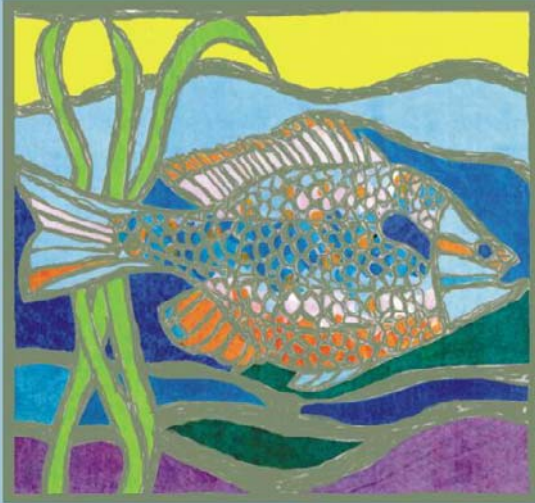
Coeur d'Alene, Idaho 31 March – 4 April, 2003