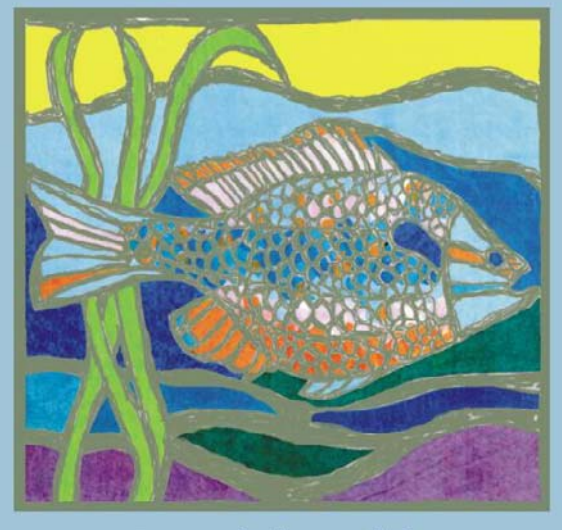
Coeur d'Alene, Idaho 31 March – 4 April, 2003