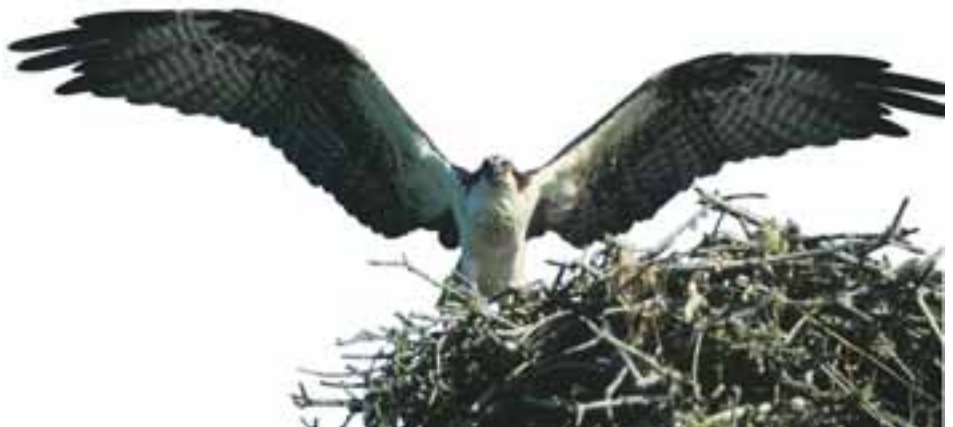
Ten Thousand Islands NWR, Florida