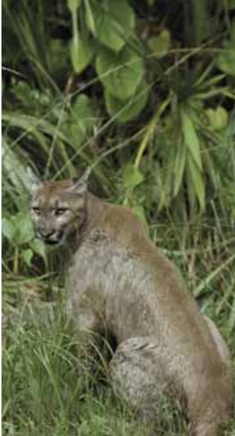
Florida Panther NWR, Florida Florida panther

As I prepare to take the reins of the National Wildlife Refuge System, I look back on what has already been accomplished with awe, and look ahead to the challenges we face with confidence. I know, coming in, that our people are the most important assets of the refuge system. I know that their intelligence, their passion for the resources in their trust, and the sometimes incredible hours they are willing to work will make the accomplishments of our future every bit as bright as the conservation victories of the past 100 years.