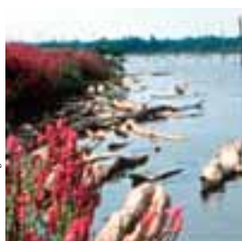
■ Montezuma NWR, NY Number of Refuges 124