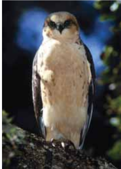
Hakalan NWR, Hawaii