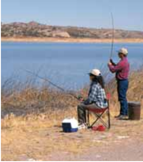
Bosque del Apache NWR, New Mexico

The American Sportfishing Association is a longstanding partner with the Service. Most people in the agency know us because of our support for the fisheries program. But we're also proud to be a part of the Cooperative Alliance for Refuge Enhancement.