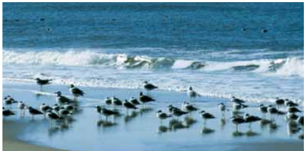
Back Bay NWR, Virginia USFWS