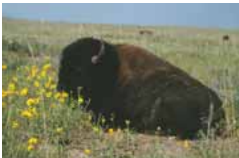
Fort Niobrara NWR, Nebraska American bison