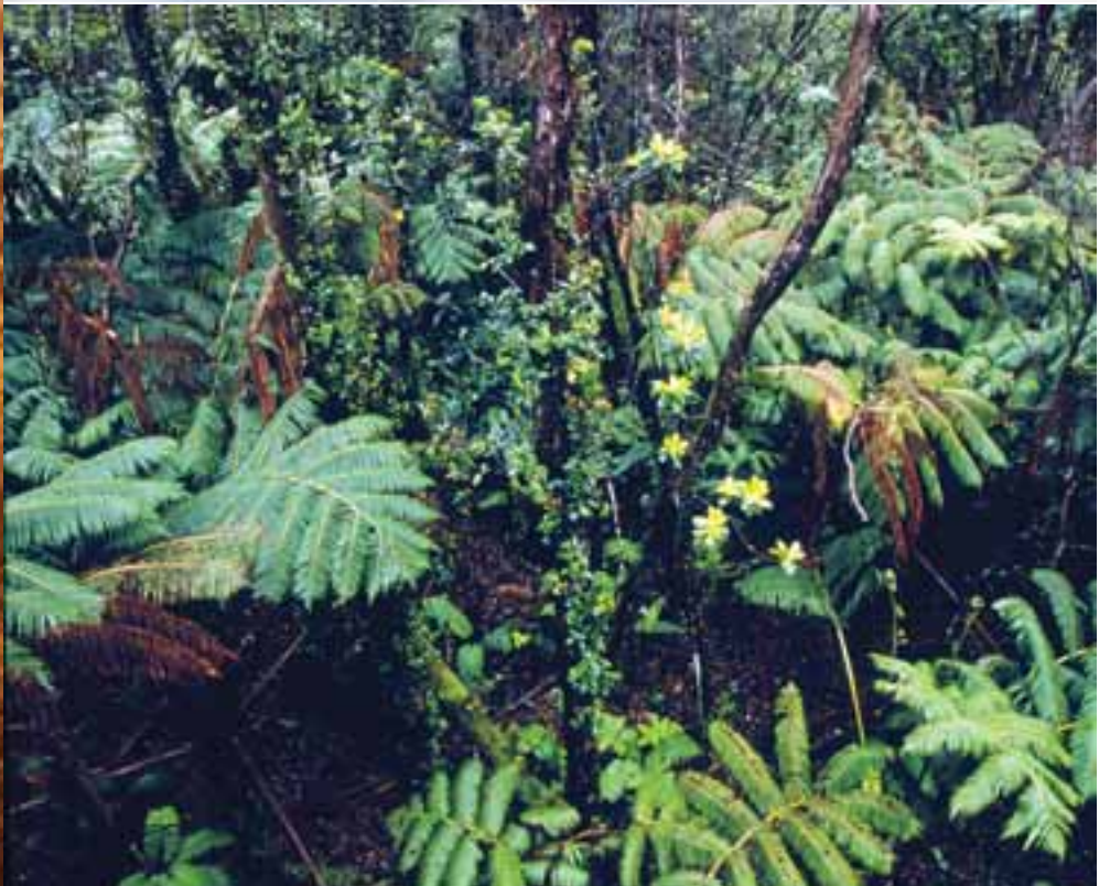
Haukalau Forest NWR, Hawaii