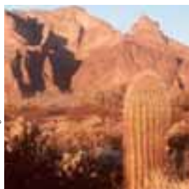
■ Kofa NWR, AZ Number of Refuges 170