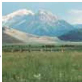
■ Red Rocks Lake NWR, MT Number of Refuges 90