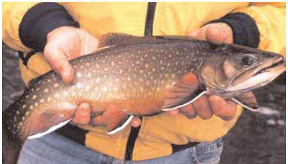
Whittlesey Creek NWR, Wisconsin Coaster brook trout