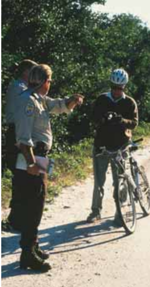
Ding Darling NWR, Florida

The Division of Law Enforcement helps protect “wild things” and “wild places” in this country, including national wildlife refuges. Service special agents work in partnership with refuge officers to uphold Federal laws that safeguard fish, wildlife and their habitat.