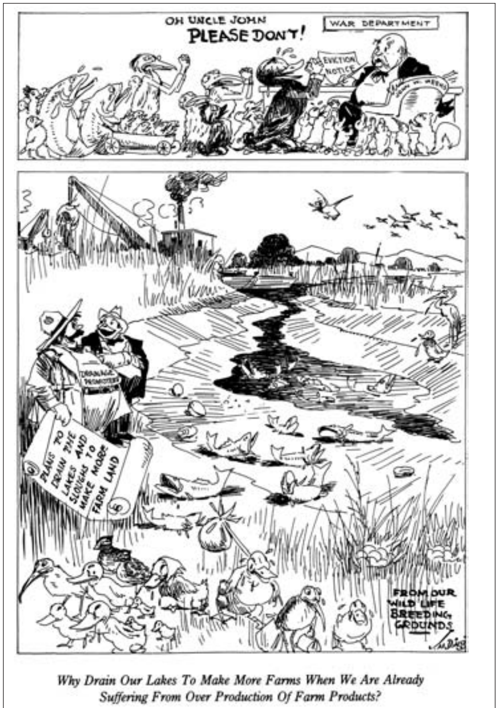
J.N. "Ding" Darling cartoon

They got quite a bit of that money for the Biological Survey, and embarked on a crusade that would revitalize the hard-pressed Survey and its refuges. It would end only when World War II interfered.