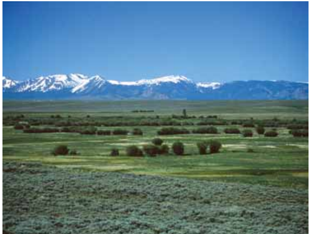
Arapaho NWR, Colorado