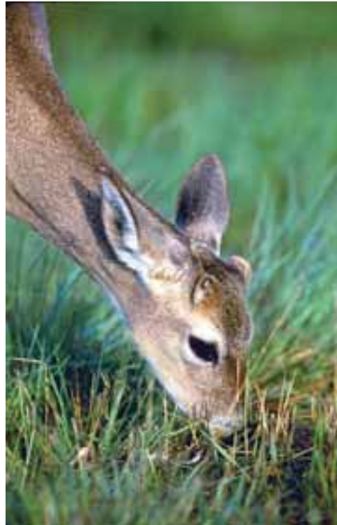
Key Deer NWR, Florida Key deer