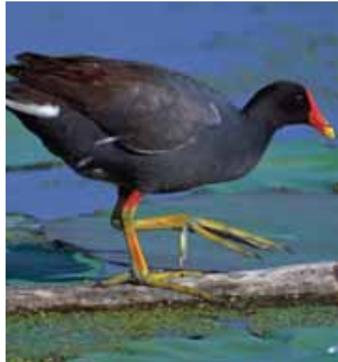
Squaw Creek NWR, Missouri