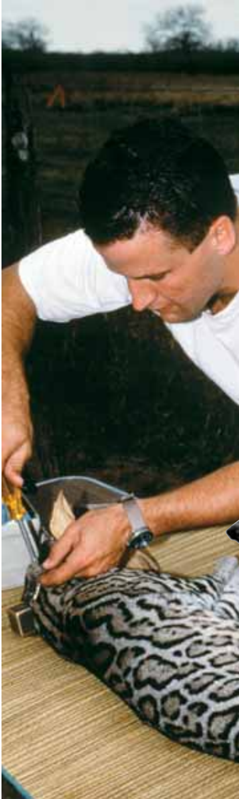
Laguna Atascosa NWR, Texas Ocelot