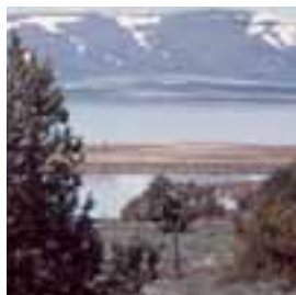
■ Clear Lake NWR, CA Number of Refuges 26