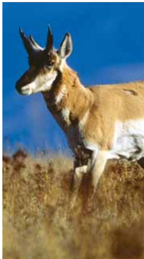
National Bison Range, Montana Pronghorn