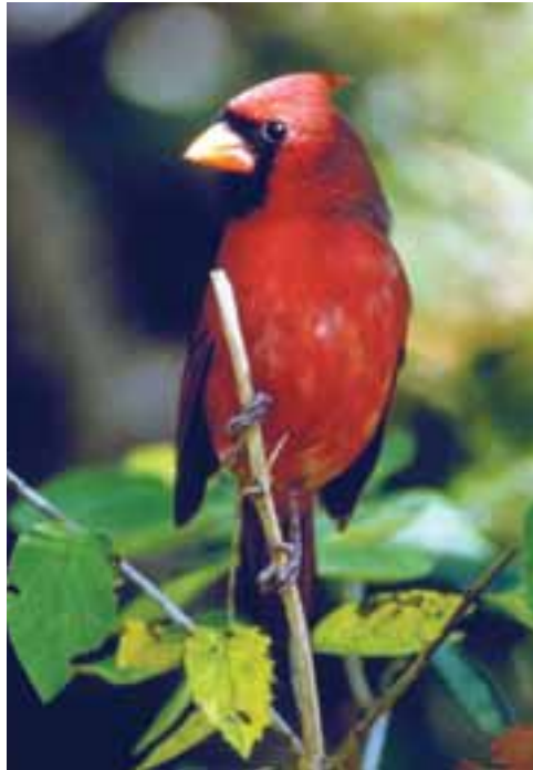
Morton NWR, New York

It would be difficult to find a conservationist who hasn't heard or used that phrase at least once during his life. It's a good metaphor, eliciting the vision of the interconnectedness of all creatures great and small to sustain life. The metaphor works for the Service, too — one division connected to another, all needed to successfully preserve the mission of the Service — and that's why the National Wildlife Refuge Centennial is not just a celebration for those working on a refuge, it's a celebration for all of us working for the Service.