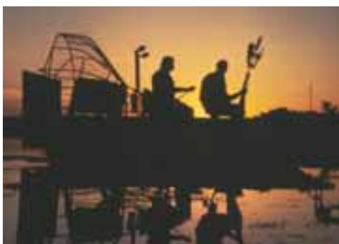
Air boats

The National Conservation Training Center Museum has grown rapidly in recent years. Holdings now include diverse objects, ranging from an old wall box telephone to documents signed by Presidents Theodore Roosevelt and John F. Kennedy. This large collection was put to good use by the producers of “Arctic Dance,” a film about Mardy Murie, the grandmother of the conservation movement, and the History Channel’s “Dangerous Missions,” an episode about Service Law Enforcement.