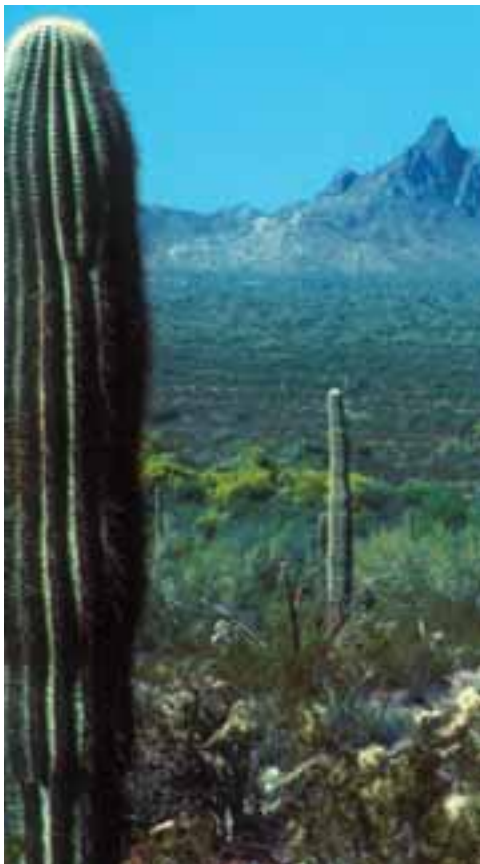
Cabeza Prieta NWR, Arizona