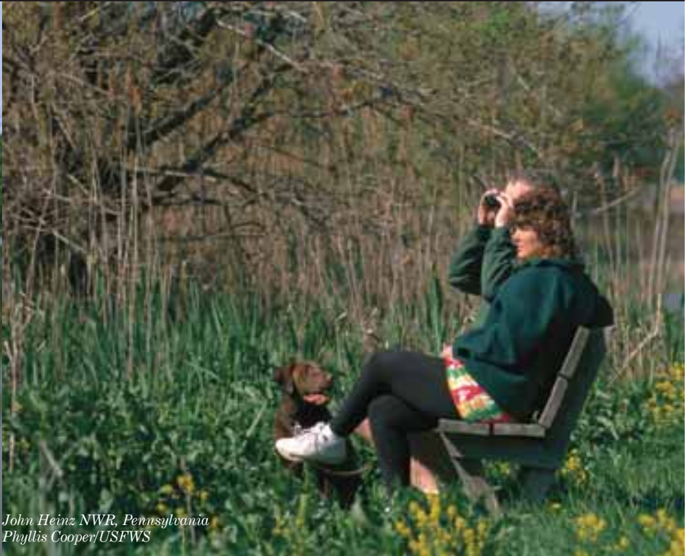
John Heinz NWR, Pennsylvania