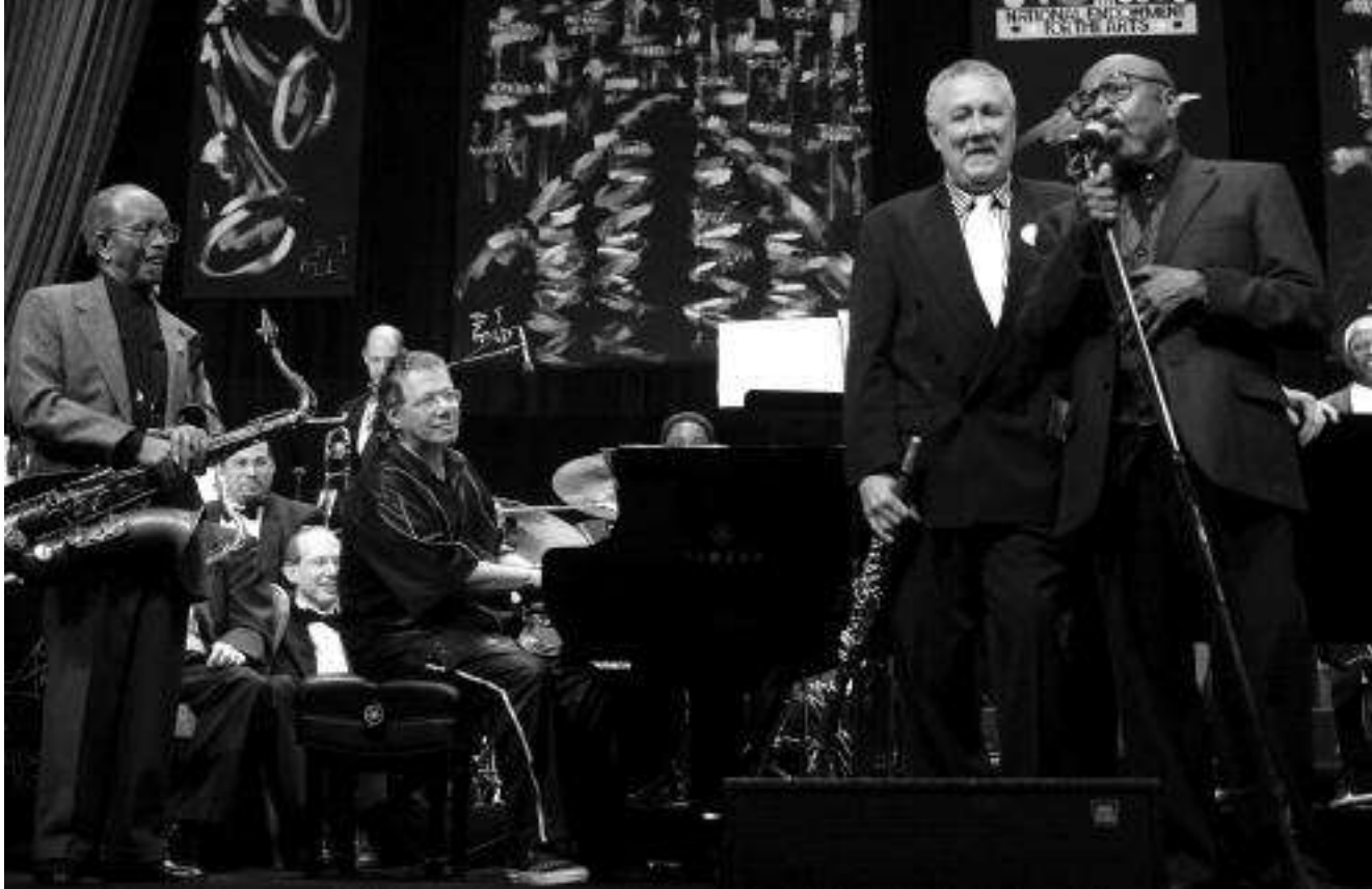
NEA Jazz Masters Jimmy Heath, Chick Corea, Paquito D’Rivera, and James Moody take the stage during the annual NEA Jazz Master concert and awards ceremony at the International Association for Jazz Education conference.