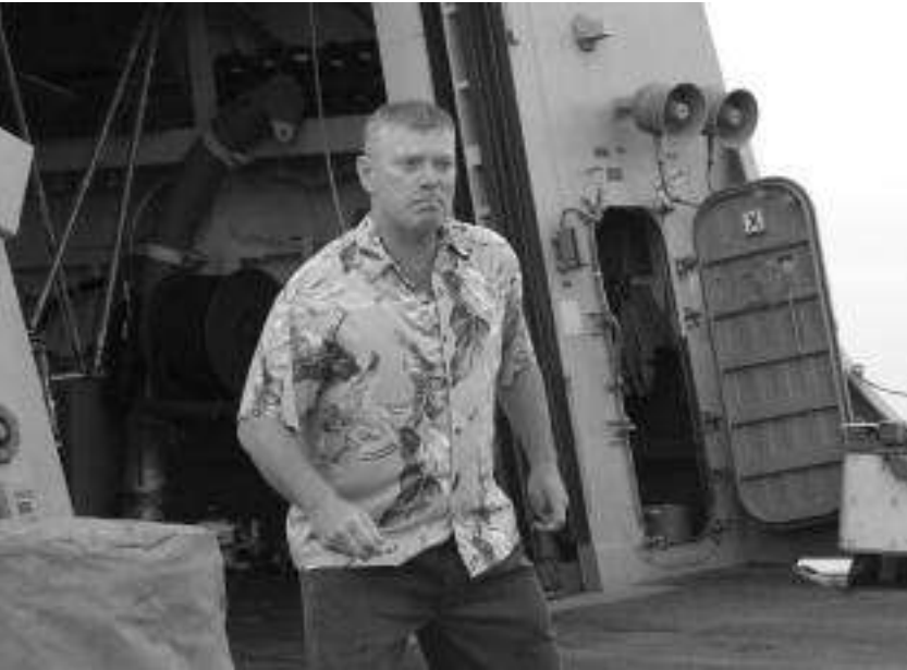
Stephen Lang performs his one-man show, Beyond Glory , aboard the USS Mustin in the Persian Gulf as part of the NEA Operation Homecoming initiative.