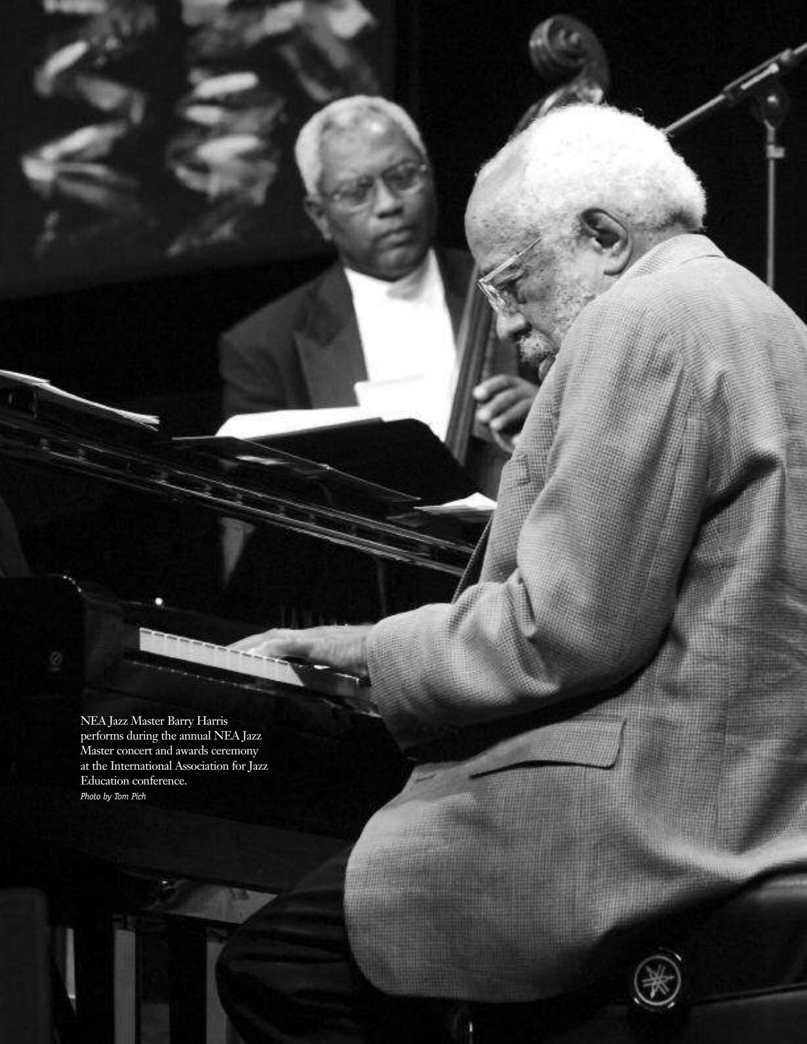
NEA Jazz Master Barry Harris performs during the annual NEA Jazz Master concert and awards ceremony at the International Association for Jazz Education conference.