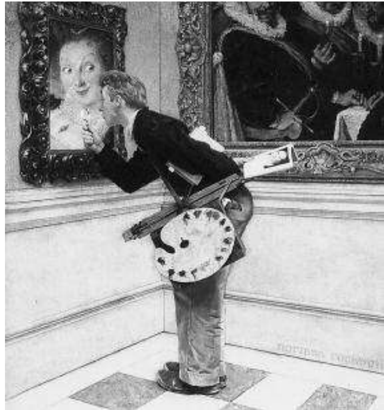
The Art Critic by Norman Rockwell is one of the works to be featured in the touring exhibition American Chronicles: The Art of Norman Rockwell (1894-1978) by the Norman Rockwell Museum at Stockbridge, Massachusetts, as part of NEA's American Masterpieces.

The first grants given out under the initiative in FY 2005 were in the visual arts. Eleven grants were awarded, totaling $1,183,000. One of the exhibitions