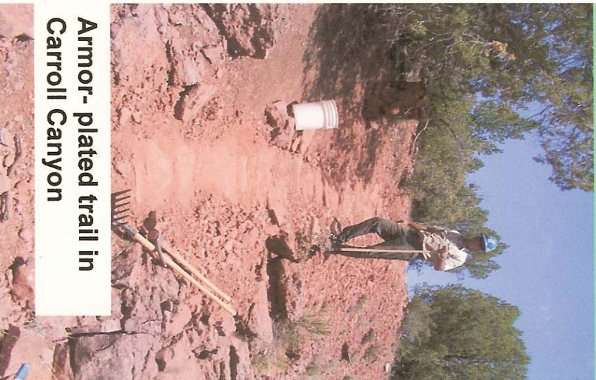
Armor-plated trail in Carroll Canyon