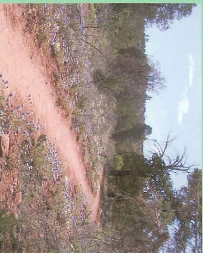
Rangers completed the entire Honanki loop with the help of The Friends of the Forest, The Sierra Club, the NCCC Crew and the AD Crew