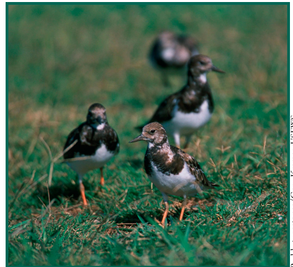
Ruddy turnstones

Small Grants Program: Small Grants support the same kinds of activities in the United States that Standard Grants support, but involve fewer grant dollars. In FY 2007, a minimum of $2 million has been allocated for Small Grants projects; grant requests may not exceed $75,000. Projects that have a grantee or partner(s) new to the Act's Grants Program are encouraged.