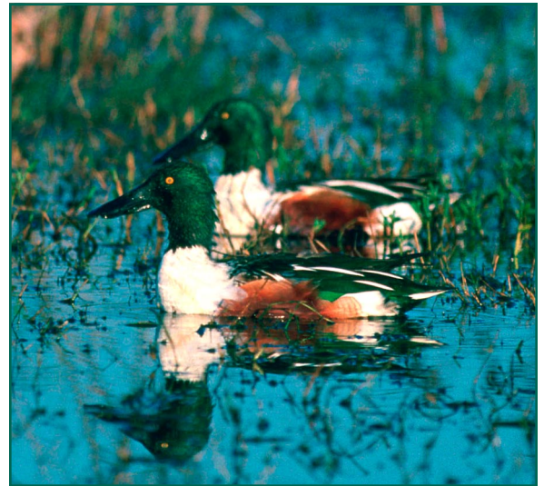
Northern shovelers