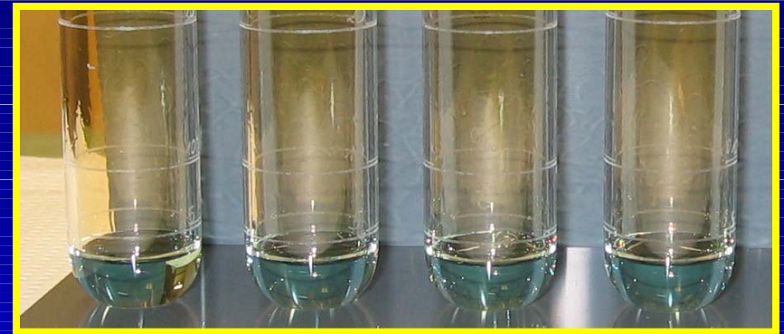
After Wet Ashing