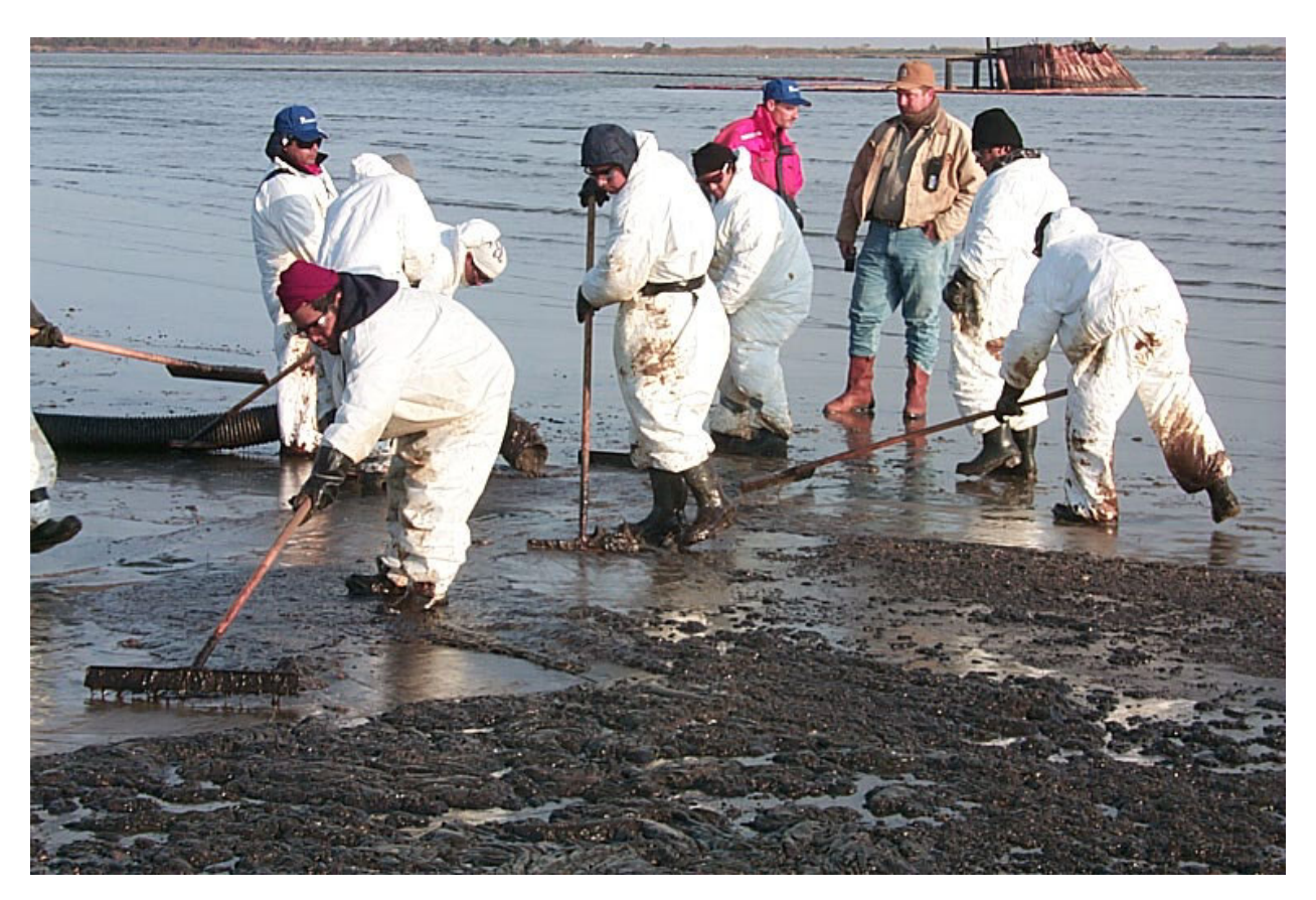
Figure 3. Cleanup of the viscous oil early in the morning when it was below the pour point.

The oil had a high paraffin content and a low asphaltene content. When spilled, the oil did not spread as thin film or sheen as is typical for a light crude oil (see Fig. 1). On cool mornings, the temperature was below the pour point of the oil, causing the oil to have the consistency of margarine. Figure 3 shows cleanup workers using squeegees to push the oil into piles for recovery. The oil readily formed an emulsion; three samples collected within the first few days contained 32, 43, and 63 percent water by weight. The spilled oil was not in the ADIOS database, but distillation data were obtained and used to run the ADIOS2 model.