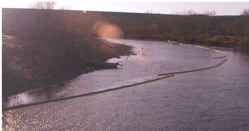
Figure 3. Photograph of Cascade Diversion Booming