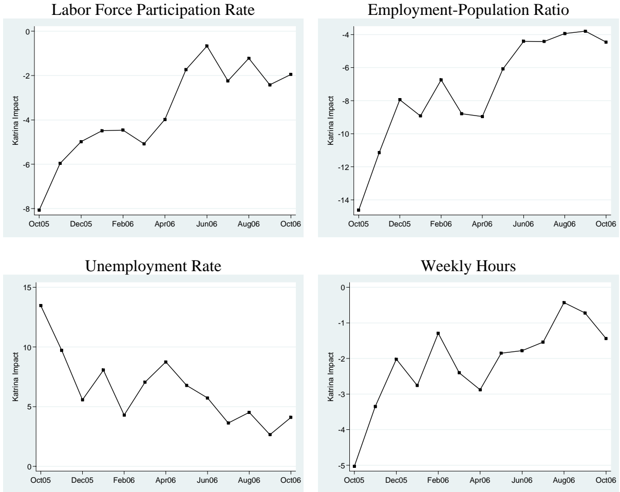
Figure 2. Monthly Estimates of the Effect of Katrina on Evacuees