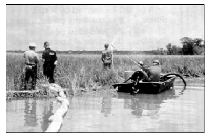
Crews work to keep oil from entering a marsh.