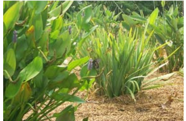
ReCip® Constructed Wetlands