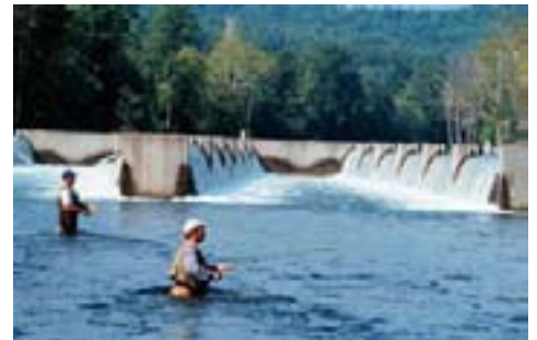
South Holston Aerating Weir

Web site: www.tva.com/environment/envservices/