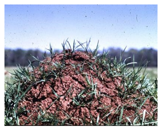
Red imported fire ant- mound

RIFA are more aggressive than most native ants and have a painful sting. They respond to pheromones released by the first ant to attack. The ants swarm and sting immediately when any movement is sensed. The sting of RIFA contains a venom composed of a necrotizing alkaloid, which causes both pain and the formation of white pustules which appear one