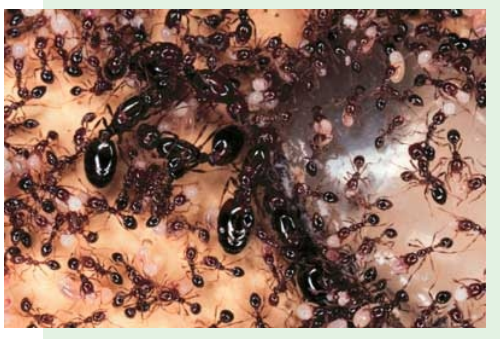
Red imported fire ant- colony of reinfestation are more in such treatments.

Early detection and subsequent nest treatment is the best measure to prevent the establishment of fire ant colonies in a new environment.Insecticides can either be applied to individual mounds or may be broadcast over a wide area. Mound specific treatment is environmentally and ecologically acceptable. Individual treatments can be done by mound drenches, surface dusts and mound injections. However, the disadvantage is that individual mounds must be located in order to be treated. In broadcast treatments, granular insecticides are used, which the ants carry to the colony and fed to nest mates and the queen. Mound drenches, surface dusts and mound injections may not necessarily reach the queen, who may be deep in the nest. So, the chances