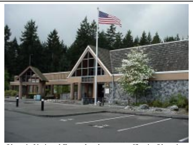
Olympic National Forest headquarters office in Olympia, Washington.