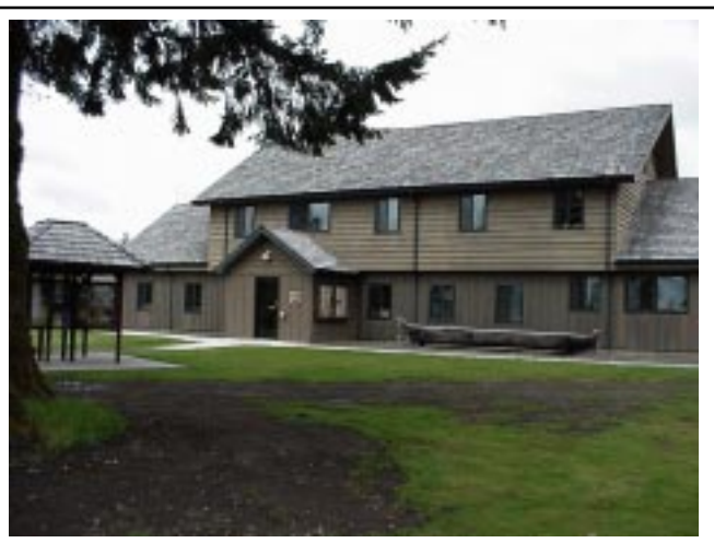
Pacific Ranger District's Forks Office.

The ONF/ONP Recreation Information Office is located on Highway 101 in the middle of Forks on the east side of the highway.