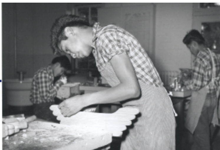
Student in Industrial Arts Class, ca. 1943

SUNDAY MONDAY TUESDAY WEDNESDAY THURSDAY FRIDAY SATURDAY