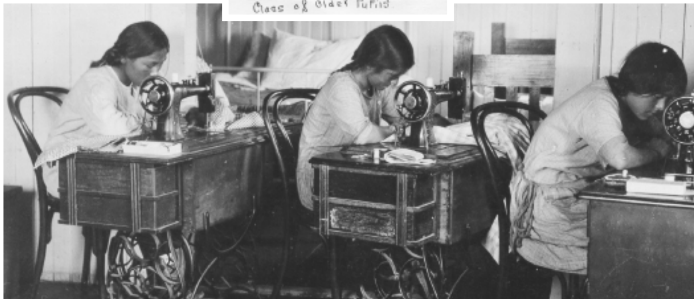
Sewing class at U.S. Public School at Wainwright, 1924-1925