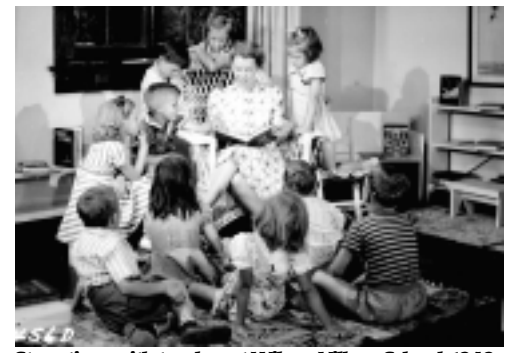
Story time with teacher at Wilson Village School, 1940

Exhibit: Philadelphia, PA Melting Pot Woes: Ethnic Suspensions on The Homefront 1917-1918