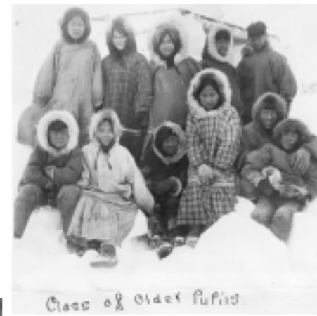
Class of Older Students at Wainwright, 1925

The U.S. Public School at Wainwright was completed in 1905, with a capacity for sixty students. They had a classroom, a Native store, a shop, a living room, a kitchen, pantry, hallway, and teacher living quarters. The school was heated by gas lamp. There was no indoor plumbing, as no water or sewer connections existed. Wainwright, located on the shore of the Arctic Ocean, was icebound and inaccessible, except in August of each year.