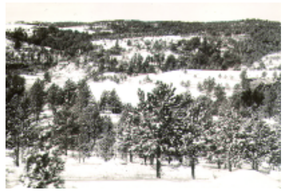
Winter Landscape, c. 1950 RG 79, NARA's Central Plains Region