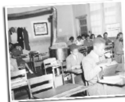
RG 21, NARA's Mid-Atlantic Region

Exhibits: Mid-Atlantic Region Philadelphia, PA Education in Black & White Around the World With the USS Olympia