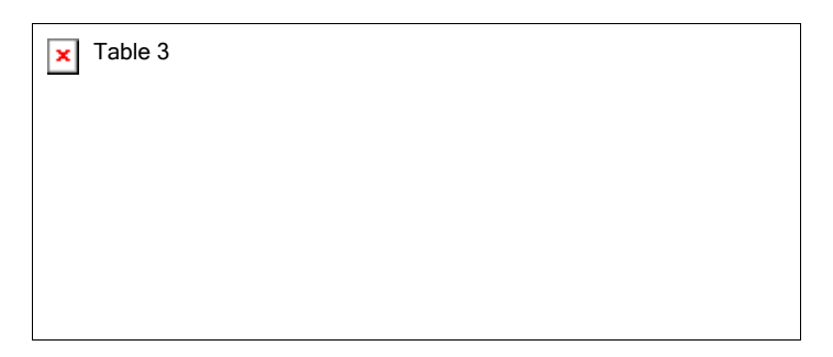
TABLE III. Results From a Randomized, Assessor-blind, Group Comparative, Single Center Safety and Efficacy Study of Follistim® (Protocol 37604) in Infertile Women Treated With In Vitro Fertilization With Follistim® or Humegon® Without Pituitary Suppression With a GnRH Agonist1

Results from a randomized, assessor-blind, group comparative, single center safety and efficacy study of Follistim® (Protocol 37604) in 89 infertile women treated with in vitro fertilization with Follistim® or Humegon® without pituitary suppression with a GnRH agonist are summarized in Table III.