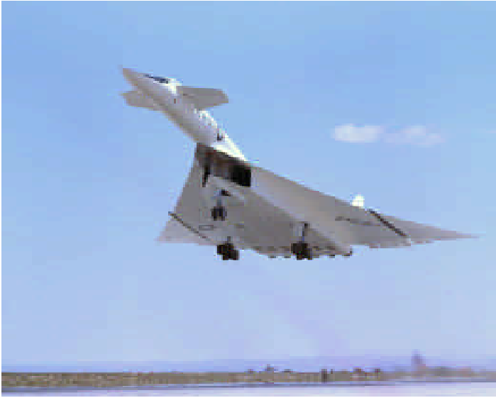
NASA Photo ECN-792. XB-70A during take-off.

would be uncomfortable for the passengers, increase the pilots' workload, and shorten the structural fatigue life of the SST.