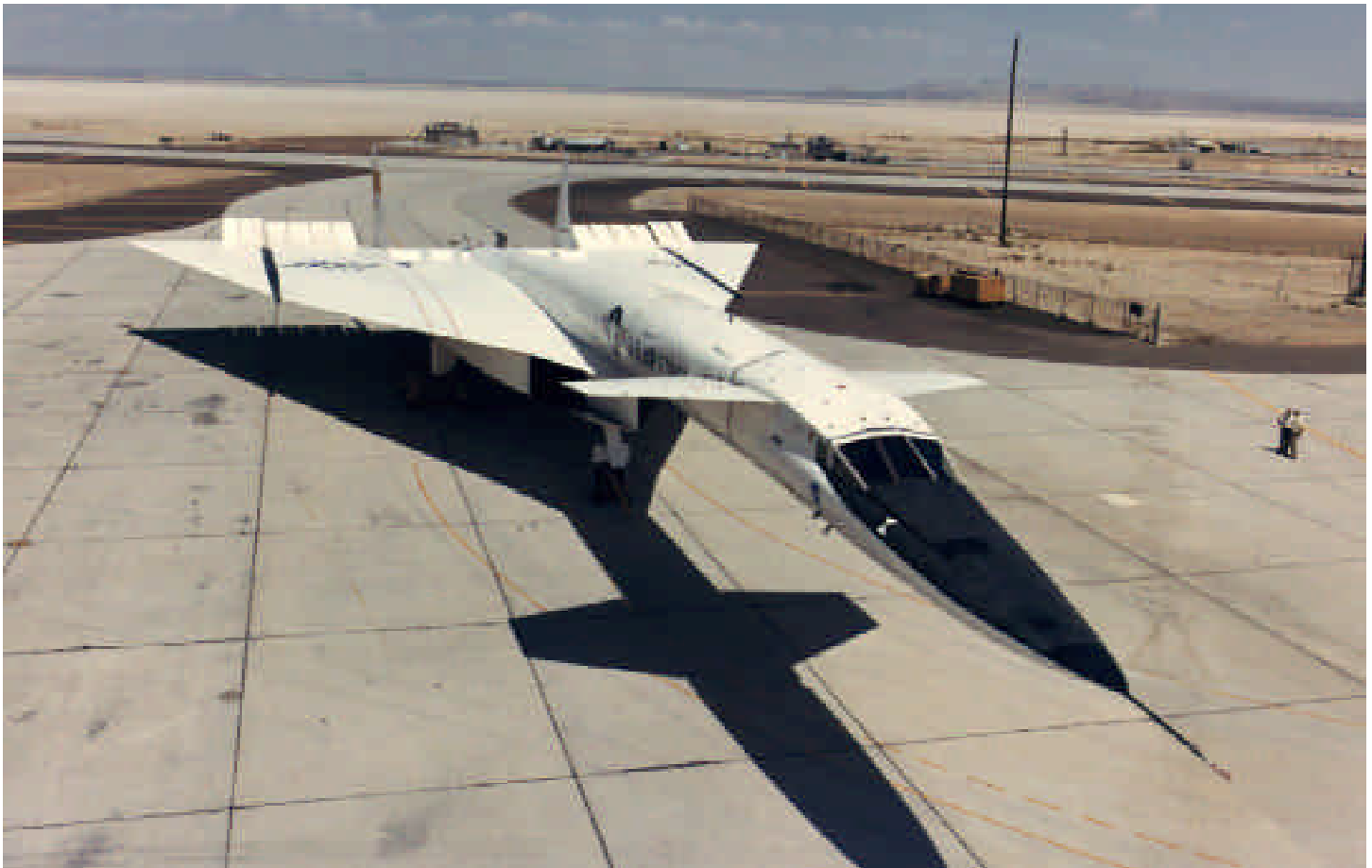
NASA Photo ECN-1814. XB-70A Valkyrie on ramp.

The B-70 Valkyrie, with a planned cruise speed of Mach 3 and operating altitude of 70,000 feet, was to be the ultimate high-altitude, high-speed manned strategic bomber. Events, however, would cause it to play a far different role in the history of aviation.