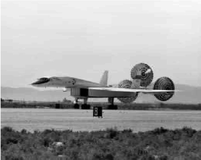
Photo ED97-44244-3. XB-70 landing.

of the wing panels reduced the drag caused by the wingtips interacting with the inlet shock wave. The repositioned wingtips also reduced the area behind the airplane's center of gravity, which reduced trim drag. The downturned outer panels also provided more vertical surface to improve directional stability at high Mach numbers. Attached to the delta was a long, thin forward fuselage. Behind the cockpit were two large canards, which acted as control surfaces.