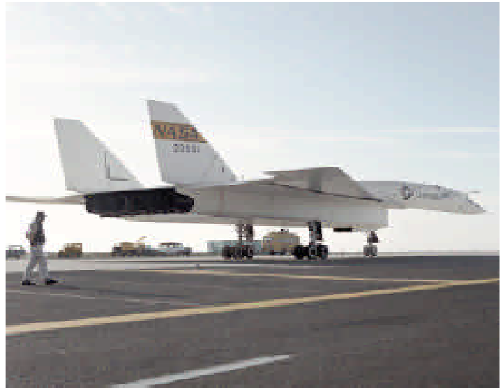
Photo EC68-2101. XB-70A on ramp.

Following these tests, the XB-70 was grounded for maintenance that lasted 2 1/2 months. The Air Force had concluded by that point that the XB-70 program should be turned over to NASA as soon as possible.