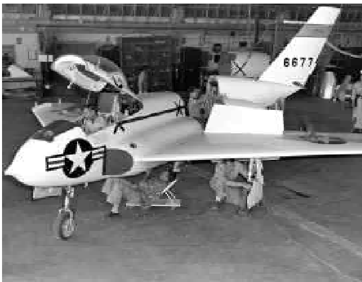
NASA Photo E-1000A. X-4 disassembled "O" ring with flight crew.

or footstool. A person standing on the ground could easily look into the cockpit. For control without horizontal tail surfaces, the X-4 used combined elevator and aileron control surfaces (called elevons) for control in pitch and roll attitudes. The aircraft also had split flaps, which doubled as speed brakes.