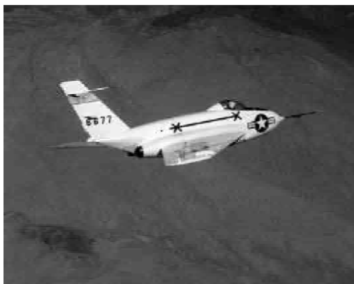
NASA Photo E-359. X-4 on Ramp.

The balsa strips were removed, and the X-4 then undertook a long series of flights to test landing characteristics. By opening the speed brakes, the lift-