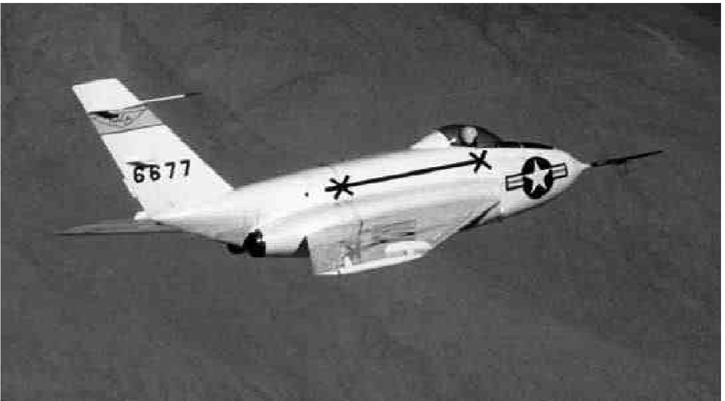
In flight photo of the X-4.

The X-4 was designed to test a semi-tailless wing configuration at transonic speeds. Many engineers believed in the 1940s that such a design, without horizontal stabilizers, would avoid the interaction of shock waves between the wing and stabilizers. These were believed to be the source of the stability problems at transonic speeds up to Mach 0.9. Two aircraft had already been built using a semi-wingless design - the rocket-powered Me-163 Komet flown by Germany in World War II, and the British de Havilland DH.108 Swallow built after the war. The Army Air Forces signed a contract with the Northrop Aircraft Company on June 11, 1946, to build two X-4s. Northrop was selected because of its experience with flying wing designs, such as the N9M, XB-35 and YB-49 aircraft.