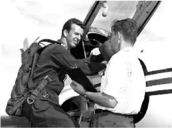
NASA Photo E-839. Pilot Joe Walker/X-4 preflight briefing

The X-4's primary importance involved proving a negative, in that a swept-wing semi-tailless design was not suitable for speeds near Mach 1. Aircraft designers were thus able to avoid this dead end. It was not until the development of computer fly-by-wire systems that such designs could be practical. Semi-tailless designs appeared on the X-36, Have Blue, F-117A, and Bird of Prey, although these aircraft all differed significantly in shape from the X-4.