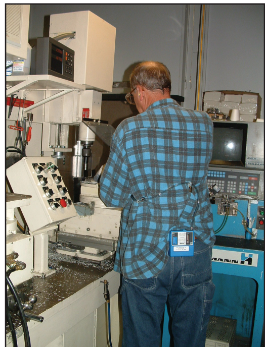
Worker wearing personal breathing zone air sampler