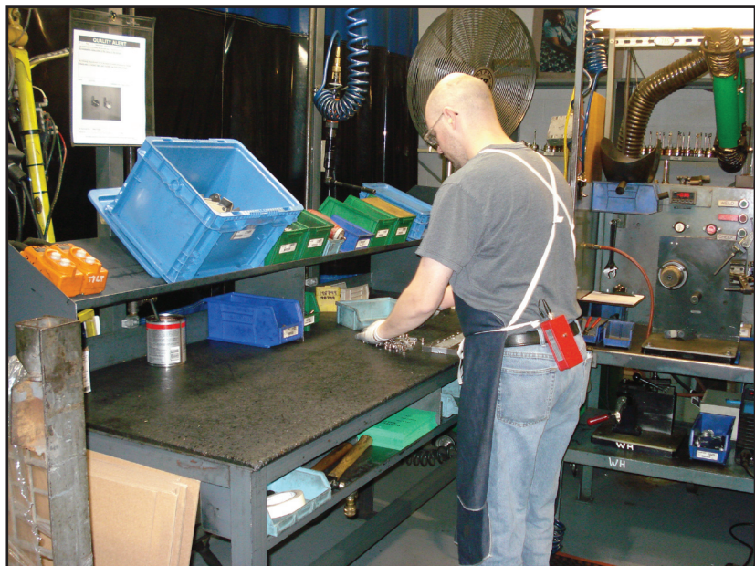
Monitoring a worker's exposure to noise during a machining operation

By the 1990s, it was evident within the field of industrial hygiene that OSHA's expanded health protection standards would only be available for a few hazardous materials. The professional consensus on occupational exposure assessment evolved away from a focus solely on compliance with OSHA standards to a generic approach based on risk management principles. The AIHA issued the first edition of A Strategy for Assessing Occupational Exposures in 1991. The second edition, renamed A Strategy for Assessing and Managing Occupational Exposures , was published in 1998, and the third edition was published