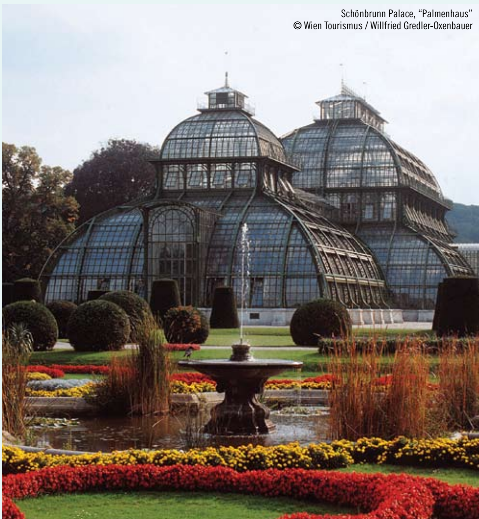
Schönbrunn Palace, "Palmenhaus"