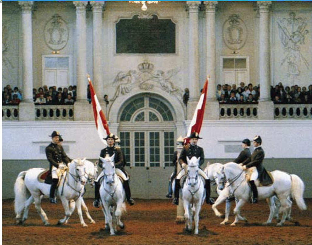
The Imperial Spanish Riding School: School Quadrille

The International Water Association is a company limited by guarantee. Registered in England No. 3597005. Registered charity (England) No. 107690.