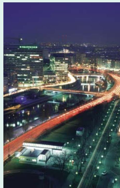
Over the roofs of Vienna: Danube canal

A new initiative for Vienna will be the creation of a "specialist group island" which will serve as a meeting and information point and showcase the work and activities of each of the groups. The IWA specialist group programme officer and key specialist group leaders will be available to answer questions and provide details of how to become actively involved in the groups.