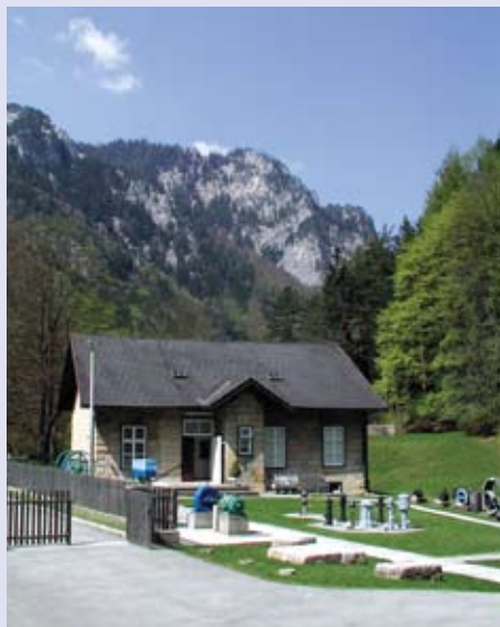
The museum at Kaiserbrunn