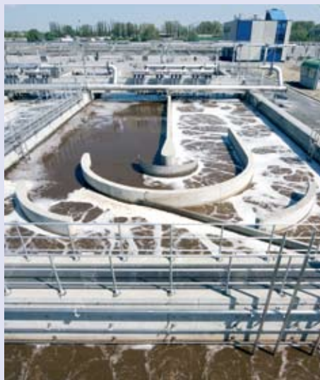
Aeration tank secondary stage