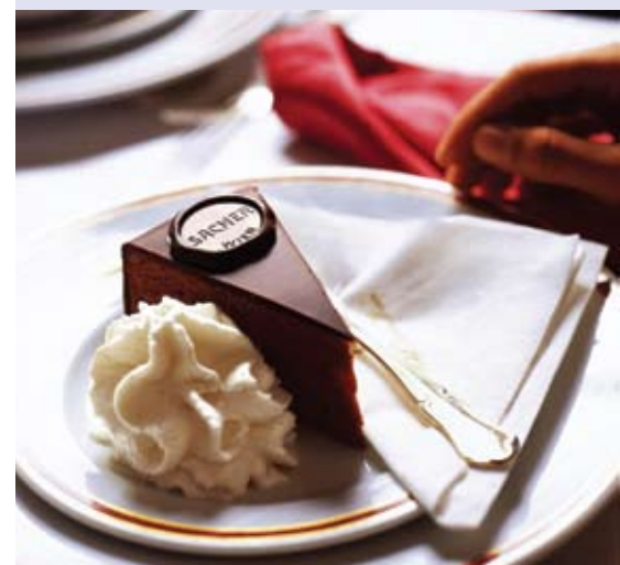
"Sacher" chocolate cake

Partner registration is via the registration form or online at www.iwa2008vienna.org