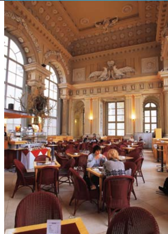
Café Gloriette

Price: € 23,00 including VAT per person including guide and admission fee.