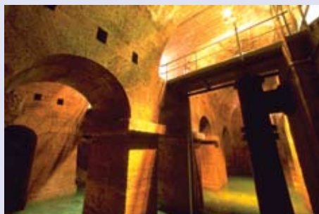
Kaiserbrunn – spring chamber

Cost: € 25,00 excluding VAT of 20% per person, including coffee break and transport.