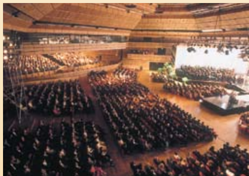
Austria Center Vienna

The welcome reception is the kick-off social event for the whole week of activities. Drinks and snacks will be served.