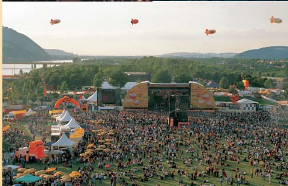
Danube Island Festival/Main stage