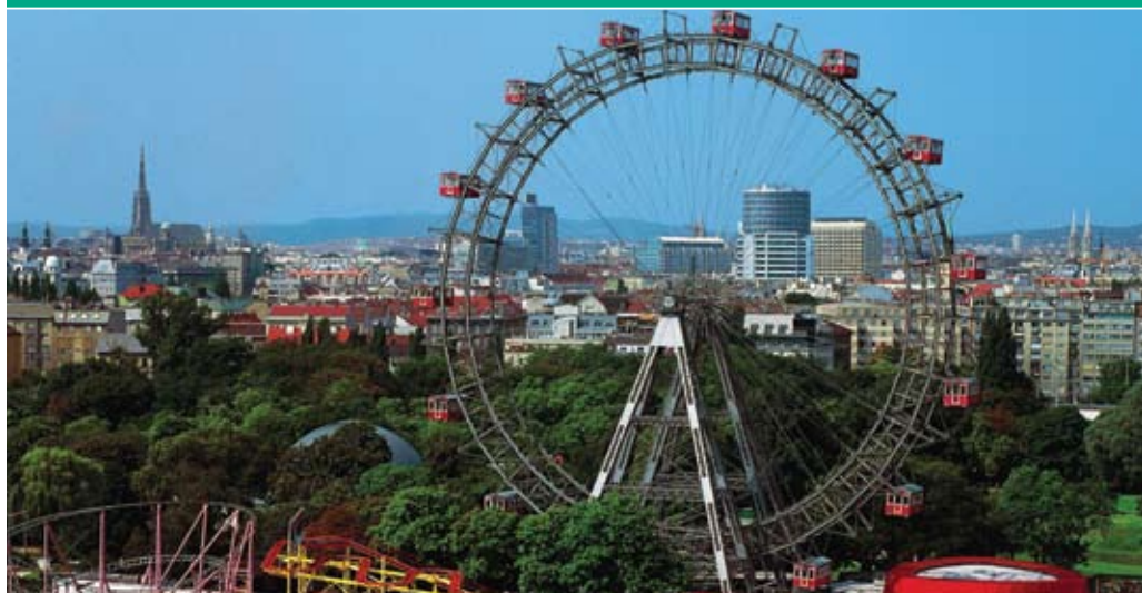
Giant ferris wheel with panoramic view