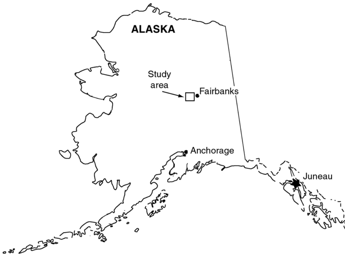
Figure 1. Map of Alaska with location of study area.

of Science thesis to evaluate the ground-water flow system of Ester Dome (Youcha, 2003). Ground-water levels were monitored at fifty sites (including all well sites sampled during this study) on Ester Dome for two years to evaluate temporal and spatial fluctuations. A ground-water flow model was developed to aid in the understanding of these geohydrologic processes.