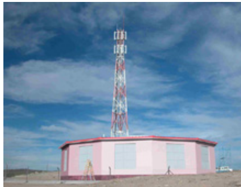
One of Auger's fluorescence telescope stations (Click on image for larger version.)

The cosmic rays collide with an air molecule and produce a shower of up to 100 billion subatomic particles. Fluorescence telescopes detect the ultraviolet light produced as the shower of particles moves through the atmosphere, and surface detectors measure the energies of the particles that reach the earth's surface. The completed observatory will have 1600 surface detector stations placed over an area of about 3000 square kilometers. Four stations containing six fluorescence telescopes each will be located on hills surrounding the surface detector stations.