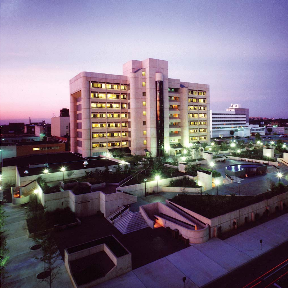
ALFRED P. MURRAH FEDERAL BUILDING OKLAHOMA CITY, OKLAHOMA