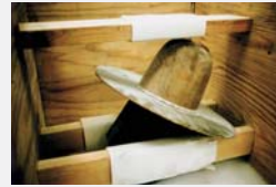
Works of art after their removal from the Murrah Federal Building and in temporary storage.