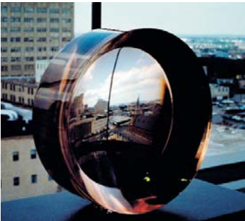
Sculpture as originally installed on the ninth-floor of the Murrah Federal Building.

Brooklyn-born artist Fred Eversley cast his round, untitled sculpture in clear polyester resin to form a concave, light-reflecting disk. The sculpture doubled as a fish-eye lens for viewing downtown Oklahoma City from the ninth-floor bay window of the Murrah Federal Building where it was originally installed. During the explosion, it was propelled through the window on to the outdoor plaza, causing a part of the disk to be broken and sheared off. The sculpture remains in pieces, testifying to the destruction of the bomb blast.