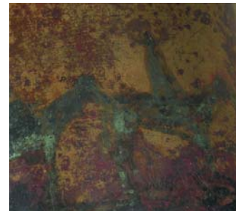
Detail, figures on horseback.