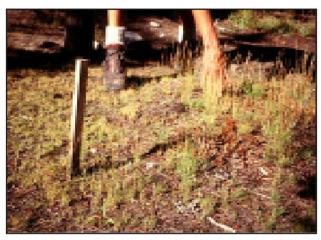
The effect of compost on plant vigor is apparent in the relative height of grasses to the right of the stake that marks the corner of the plot.

Cole and Spildie recommend that closed sites remain signed and roped off at least until vegetation cover on restored sites approximates pre-disturbance conditions. They note that even with effective restoration techniques, it will likely require hundreds of years, after impacts are confined to the levels and places deemed acceptable, to restore all the places where impact is undesirable and unnecessary. "This suggests the importance of avoiding damage in the first place, by implementing effective management programs wherever regular recreation use occurs," say the scientists.