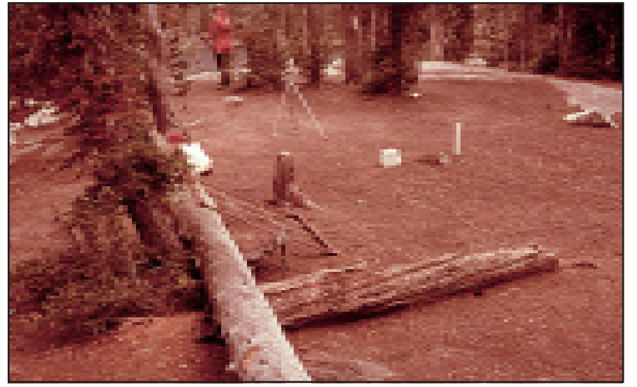
A well-impacted campsite prior to restoration, illustrating loss of vegetation and compaction of exposed mineral soil.