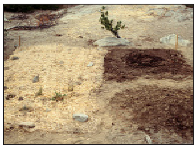
Experimental plots immediately after planting, showing mulch, transplanting and organic amendments.

Each campsite was divided into two plots, one with and one without a surface mulch application. Each plot was subdivided into six sections which received combinations of soil amendments and planting. All were scarified utilizing shovels, picks, pitchforks, hoes and hand kneading to break up compaction and clods to a depth of 15cm. Treatments that received an organics/inoculum treatment were covered with a mix of peat moss and well-decomposed, locally collected organic matter to a depth of about 2.5cm. The material was mixed with mineral soil to a depth of 7.5cm. Inoculum came from the rooting zone of local transplants that were being transplanted onto the site.