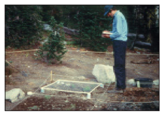
Transplant coverage being recorded, using a meter square grid.

The third growing season was hot and dry, and seedling survival declined dramatically. "This suggests that supplemental watering may be critical to effective restoration during years with hot, dry summer weather," says Cole and Spildie. "In fact, supplemental watering may be needed for several years, particularly where soils have not been amended with organic matter. It is quite possible that much of our success with seeding was the result of the supplemental watering done when seedlings were germinating during the initial growing season following seeding," they said.