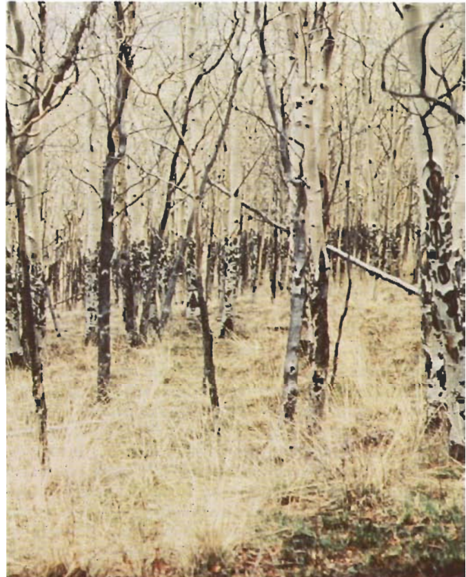
Figure 10.—Repeated bark stripping by elk has heavily damaged this stand.

the removal of the older trees; but if cut, their crowns could do considerable damage in falling. It usually is best to girdle the old trees instead of felling them. However, care must be taken to remove a band of bark large enough to prevent regrafting. Stems girdled with a single chainsaw cut have been observed to recover. 6 Girdled, they ordinarily will remain standing until most of their branches have fallen. When a snag goes down, it normally does much less damage than if it had been felled alive. Old, girdled culls may temporarily serve as nesting trees for cavity-nesting birds. It may be desirable to leave culls ungirdled if they already have nesting holes.