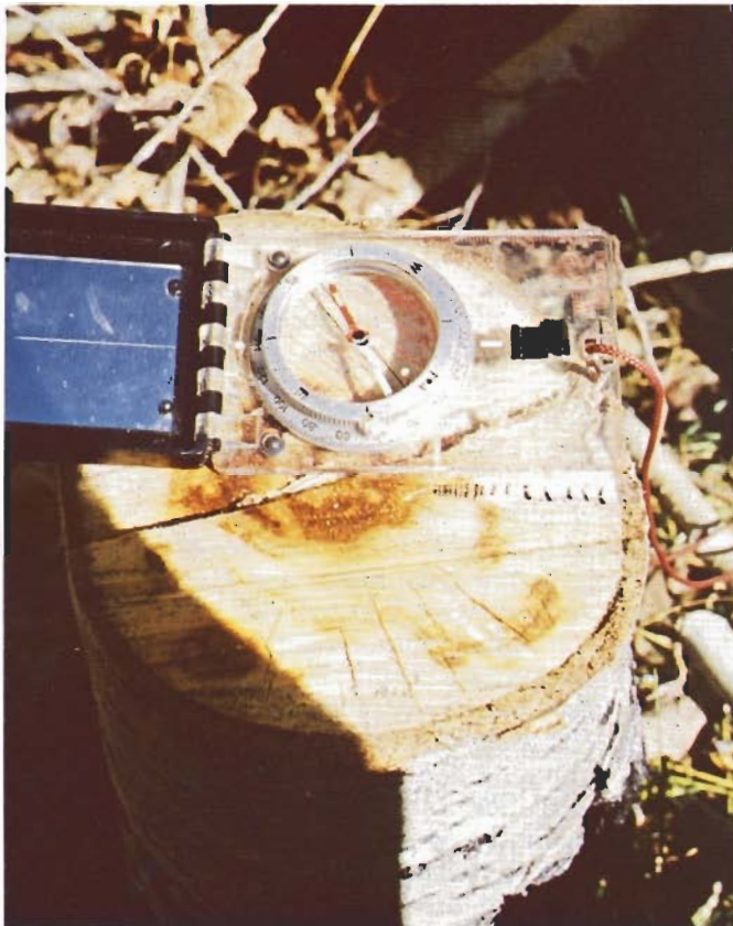
Figure 4.—This stem was damaged during a commercial thinning from above. Although diameter growth increased, the stem subsequently became infected with decay.