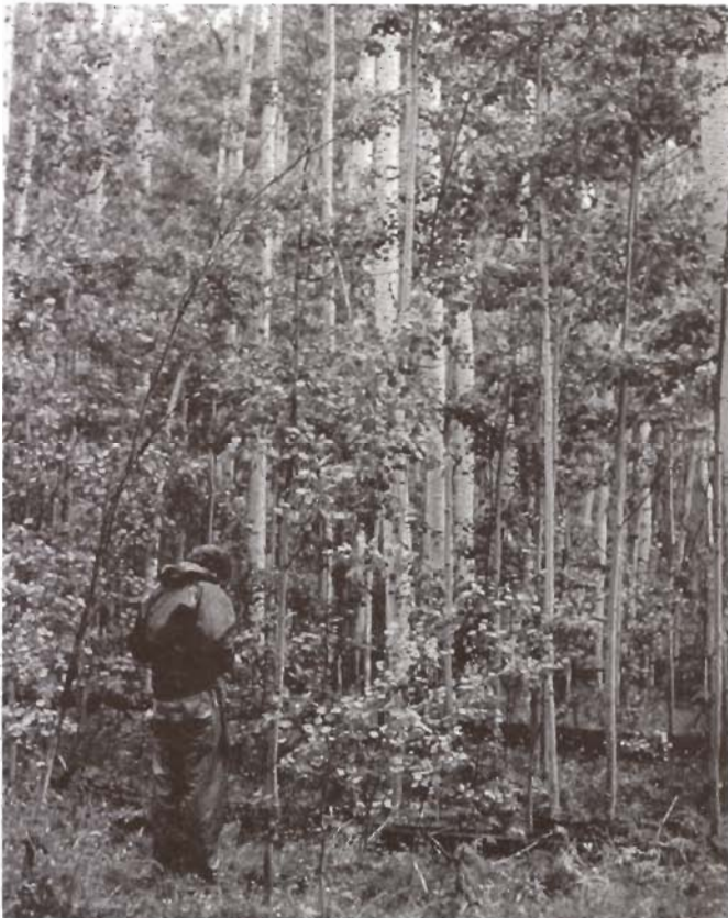
Figure 8.—Some mature aspen stands contain many unmerchantable stems.