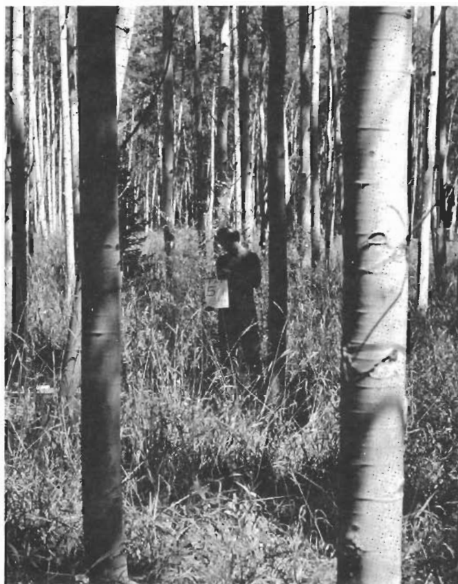
Figure 3.—Thinning pole-sized aspen stands has produced varied growth results in other areas and may not be justified in longer lived aspen stands in the West (see the ROTATIONS chapter).

the best 400 trees per acre (988 trees per ha) in the 5- and 6-year-old stands was substantially better on thinned plots. In northern Minnesota, plots in a 7-year-old sucker stand on an excellent site were thinned from 3,750 stems per acre (9,266 stems per ha) to 695 stems per acre (1,717 stems per ha) (equivalent of an 8- × 8-foot (2.5- × 2.5-m) spacing), when the dominant trees were at least 20 feet (6 m) tall. Twelve years later, the thinned plots had about nine times as much volume in stems larger than 5 inches (13 cm) diameter than did the unthinned plots (Hubbard 1972).