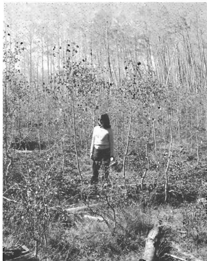
Figure 2.—A thinned 8-year-old sprout stand on the San Juan National Forest, in Colorado.

However, others have had positive results where young stands have been thinned (fig. 2). In central Canada, 2 years after very dense sucker stands 3, 5, and 6 years old were thinned (Bella 1975), there was heavy resprouting; but the new sprouts were overtopped and seemed destined to decline and die. Diameter growth of