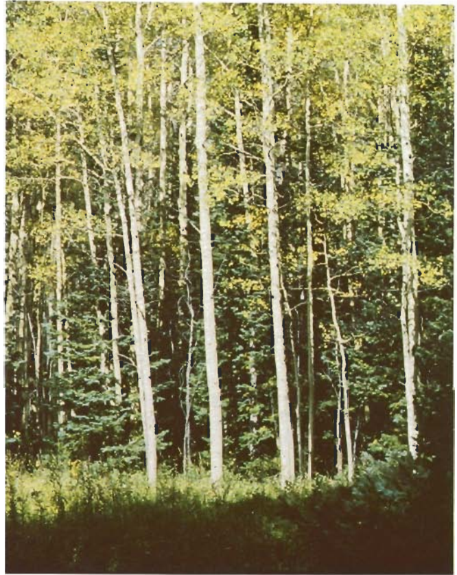
Figure 9.—Thinning or removing the aspen overstory in this mixed stand would improve conifer growth and allow quick conversion to conifer management.

If a stand will be thinned only once, it seems best to wait until the dominants are about 25 feet (8 m) tall and 2 to 3 inches (5-8 cm) in diameter. On good sites in the West, this is at about age 15. Thin to a spacing of roughly 8 × 8 feet (2.5 × 2.5 m), which leaves about 700