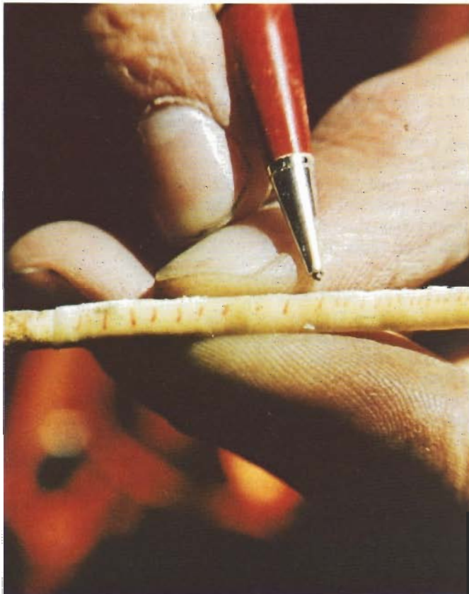
Figure 1.—The annual growth rate of this young aspen stem increased dramatically after thinning.

By definition, thinning is felling trees in an immature stand primarily to accelerate growth of the remaining trees (Ford-Robertson 1971). The term "thinning" should not be applied to salvage, sanitation, or shelterwood cuttings. Thinning an aspen stand may have any of several objectives (Perala 1978b): (1) to increase yield of large-diameter products, (2) to increase total fiber yield by cutting the trees expected to die because of competition, (3) to bring early financial return from commercial thinnings, (4) to reduce logging costs during the regeneration cut, (5) to improve conditions for regenerating aspen suckers by reducing competition, (6) to favor desirable clones in stands of small adjacent or intermixed clones, (7) to improve access and forage for livestock and wildlife, or possibly (8) to increase visibility for esthetic reasons.