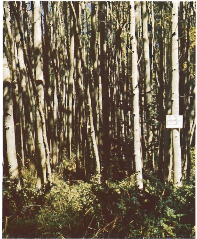
Figure 5.—An unthinned, 65-year-old stand.

The esthetics of a thinned stand involves more than the appearance of the stand itself (see the ESTHETICS AND LANDSCAPING chapter). A person can see farther into, or through, a thinned stand (figs. 5 and 6). Where forest lies between the road and a lake or other vista, thinning may be desirable to provide a better view (Esping 1963). For maximum wood production, thinning probably would be done to a semiregular spacing—a uniform spacing that is limited by the occurrence of satisfactory trees. This would make most efficient use of growing space. But, if visual diversity is desirable, then thinning in a deliberately irregular pattern may be preferable along roads, streams, and other esthetically strategic foreground views. More closely spaced groups may be left and small gaps may be created (see the MANAGEMENT FOR ESTHETICS AND RECREATION, FORAGE, WATER, AND WILDLIFE chapter). Such thinning patterns also can take advantage of the irregular or clumped stem distribution found in some clones.