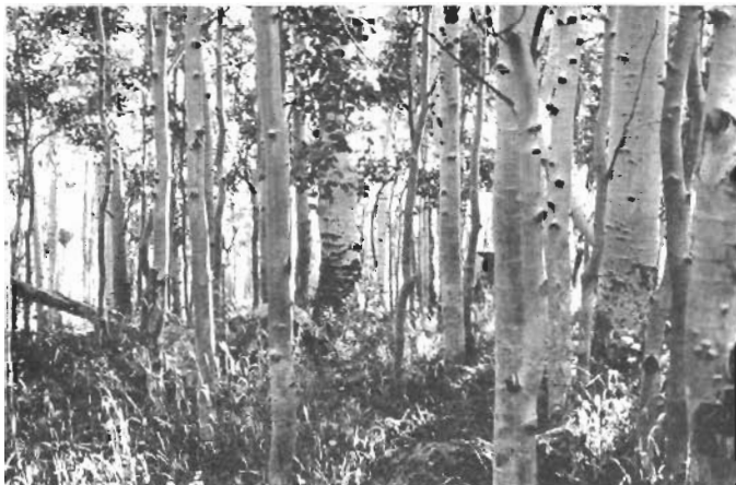
Figure 2.—A stable, uneven-aged aspen community in northern Utah.