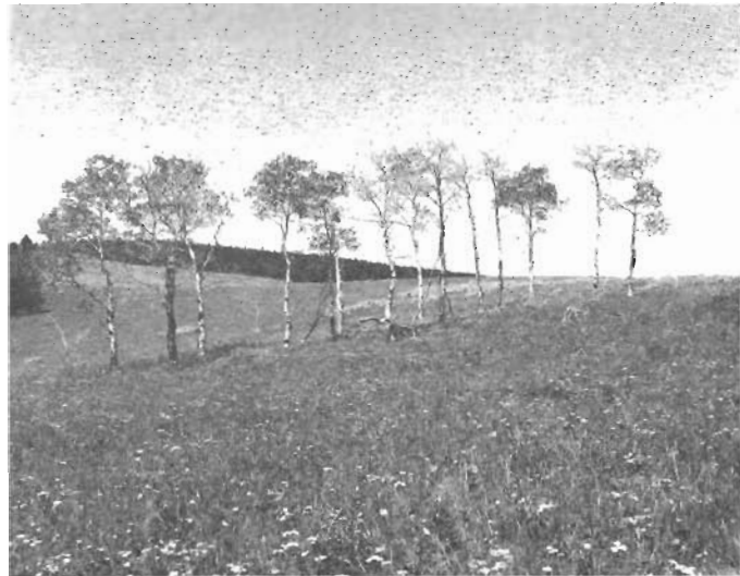
Figure 3.—A degenerating aspen community in southern Montana being replaced by mountain grassland vegetation.

during gradual deterioration of the clones (Schier 1975a) (see the VEGETATIVE REGENERATION chapter). Regeneration also can fail because of animal use. Where suckering does occur in a decadent clone, continued heavy browsing by wildlife or livestock can prevent suckers from developing into trees and cause a gradual conversion to grasslands or shrublands. (See the ANIMAL IMPACTS chapter.)