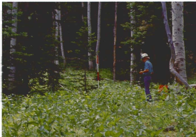
Figure 1.—A seral aspen community in northern Utah rapidly being replaced by Engelmann spruce and subalpine fir climax forest.

The uneven age distribution of aspen trees in some stands (fig. 2) indicates that aspen can be self-perpetuating without necessarily requiring a major rejuvenating disturbance such as fire. Whether such stands qualify as "climax" is unclear. An uneven-aged structure of the aspen overstory, lack of evidence of successional change in the understory, and absence of invasion by trees more shade tolerant than aspen are indicators of community stability. Such relatively stable stands that are able to persist for several centuries without appreciable change should be considered at least de facto climax, and should be managed as stable vegetation types.