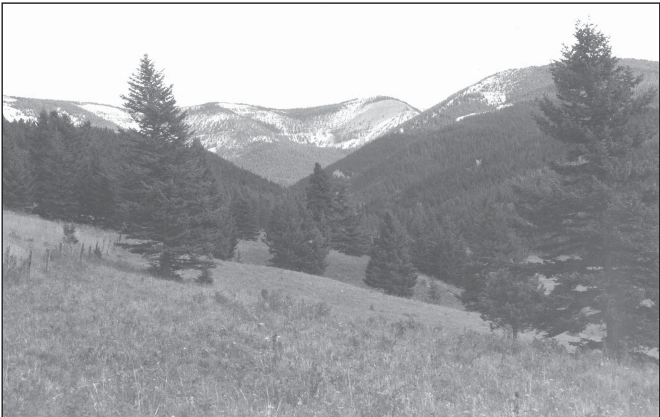
Figure 1(F) —August 20, 1980—71 years later. Camera was moved left of original point to avoid trees that screened early view. Regeneration of Douglas-fir has resulted in a landscape dominated by conifers. The rock outcrop visible in 1909 is now almost totally obscured by tree growth. Conifer competition has largely eliminated early successional understory species.