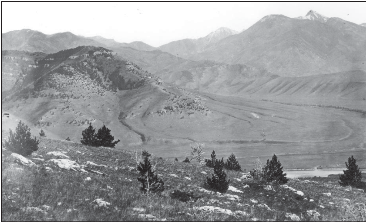
Figure 1C —1871. Fire Group 5: cool-dry Douglas-fir. Elevation 6,200 ft (1,890 m). High on the slopes above the Yellowstone River 10 miles southeast of Livingston, the view is east toward the head of Suce Creek. Snags and age of young limber pine on near slope indicate locality was swept by wildfire several decades earlier. Based on present plant composition, ground cover was apparently dominated by Idaho fescue and bluebunch wheatgrass. Fire mosaics are evident in the distance.