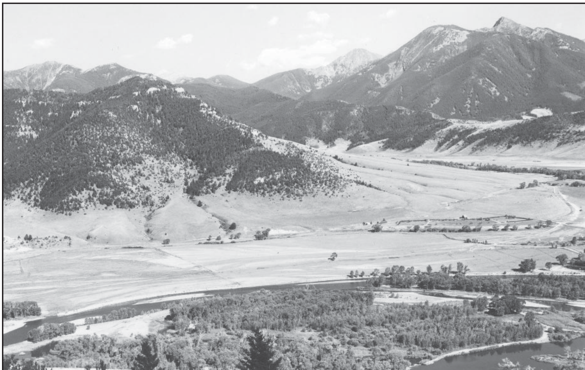
Figure 1(D) —July 27, 1981—110 years later. A dense stand of Douglas-fir, limber pine, and Rocky Mountain juniper now occupies near slope shown in original view. The grass cover on this slope has been largely eliminated by tree canopy closure. Camera was moved approximately 100 yards down slope to allow unobstructed view of distant slopes. Tree cover on distant slopes has increased dramatically.