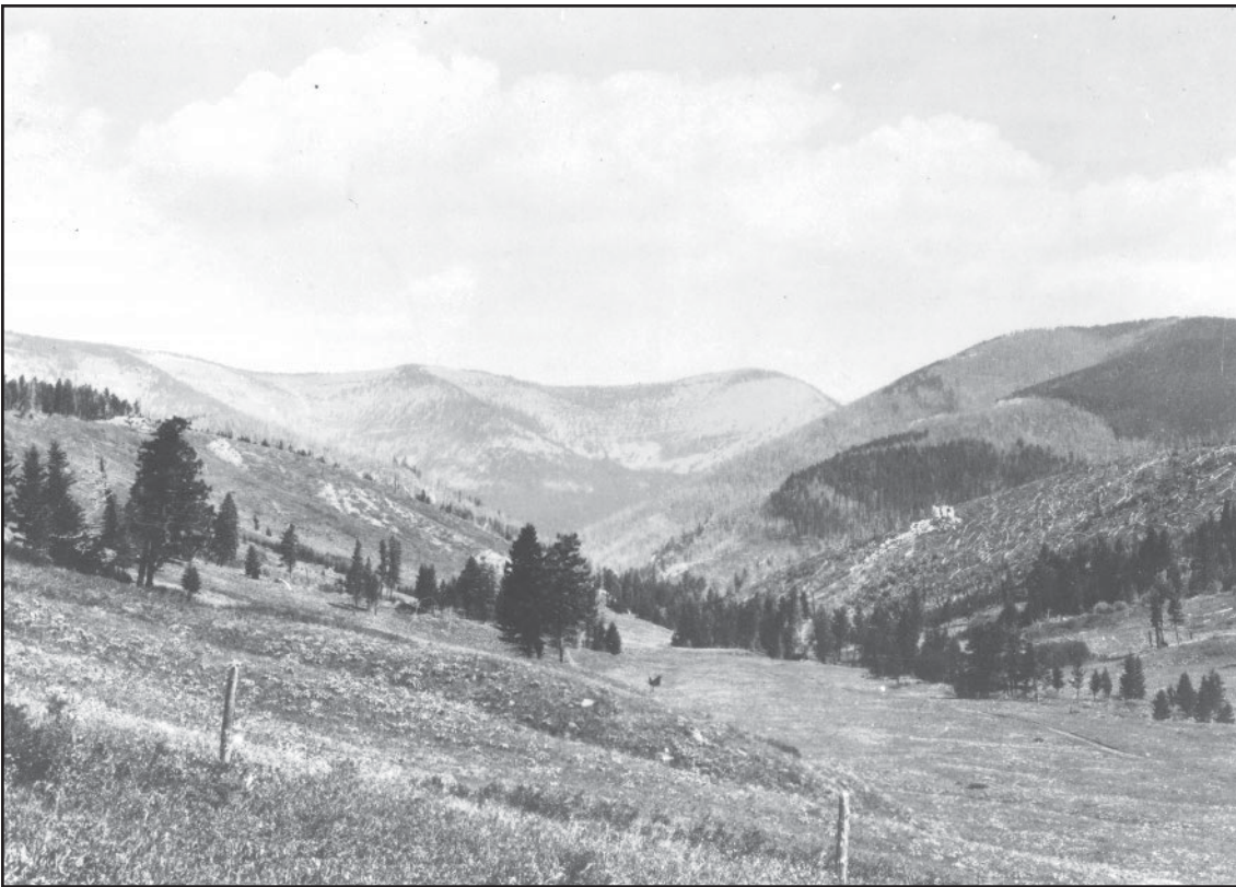
Figure 1(E) —1909. Fire Group 6: moist Douglas-fir. Elevation 6,100 ft (1,860 m). Looking north-northwest up Blake Creek at a point 1 mile above forest boundary on south side of Big Snowy Mountains, Lewis and Clark National Forest. Scene shows effects of wildfire in the late 1800s that burned both sides of drainage. Scattered ponderosa pine and Douglas-fir occupy near slope and canyon bottom. Herbs and shrubs comprise early successional vegetation in burned areas. On right, fire created a mosaic of burned and unburned timber. Note rock outcrop in burned stand.