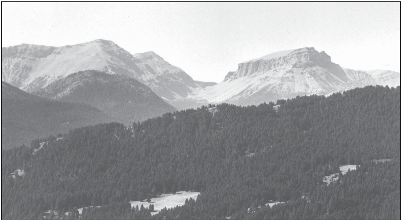
Figure 1(H) —September 16, 1981—81 years later. Slopes below camera point and adjacent terrain as well as near slope are now densely covered by Douglas-fir. View was obtained by cutting screening fir and climbing one of the larger Douglas-fir about 50 yards from original camera position at top of ridge. Canopy closure has resulted in a decline in condition of deciduous species.