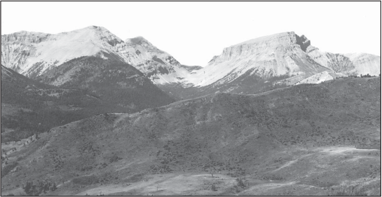
Figure 1(G) —1900. Fire Group 6: moist Douglas-fir. Elevation 5,300 ft (1,616 m). From the ridge about 5 miles west of Haystack Butte, the view is southwest across Smith Creek toward Crown Mountain on east front of Rocky Mountains, Lewis and Clark National Forest. Near slopes are in early succession following wildfire in latter 1900s that removed conifers and stimulated production of aspen, willow, chokecherry, mountain maple, and other deciduous vegetation. Stumps resulting from timber cutting and snags indicate that the pre-1900 conifer stands were less dense than current stands (U.S. Geological Survey photograph 665 by C. D. Walcott).