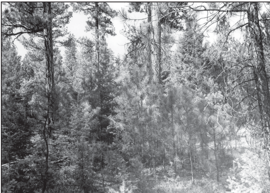
Figure 1(B) —September 1979—70 years later. Camera point replicated original position. Soil disturbance during logging and exclusion of wildfire allowed ponderosa pine and Douglas-fir seedlings to become established and develop into a dense understory. The large ponderosa pine in center foreground in the 1909 view, as well as others trees, were cut during shelterwood and selection harvests in 1952 and 1962.