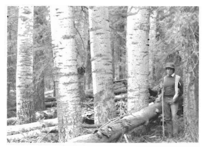
Figure 1.—A 0.1-acre plot selected to represent maximum stocking for aspen. Age 162 years, tallest trees 121 feet. Not including understory conifers, the stocking was: basal area 411 square feet per acre; dry weight (without leaves or roots) 700,800 pounds per acre; gross volume (International 1/4 inch rule) 115,500 board feet per acre. Site index was 78 feet at 80 years, which is good but not exceptional in the Southwest. Apache National Forest, Arizona.

<sup>7</sup>Personal communication with David C. Chojnacky, Renewable Resources Evaluation Unit, Intermountain Forest and Range Experiment Station, Ogden, Utah.