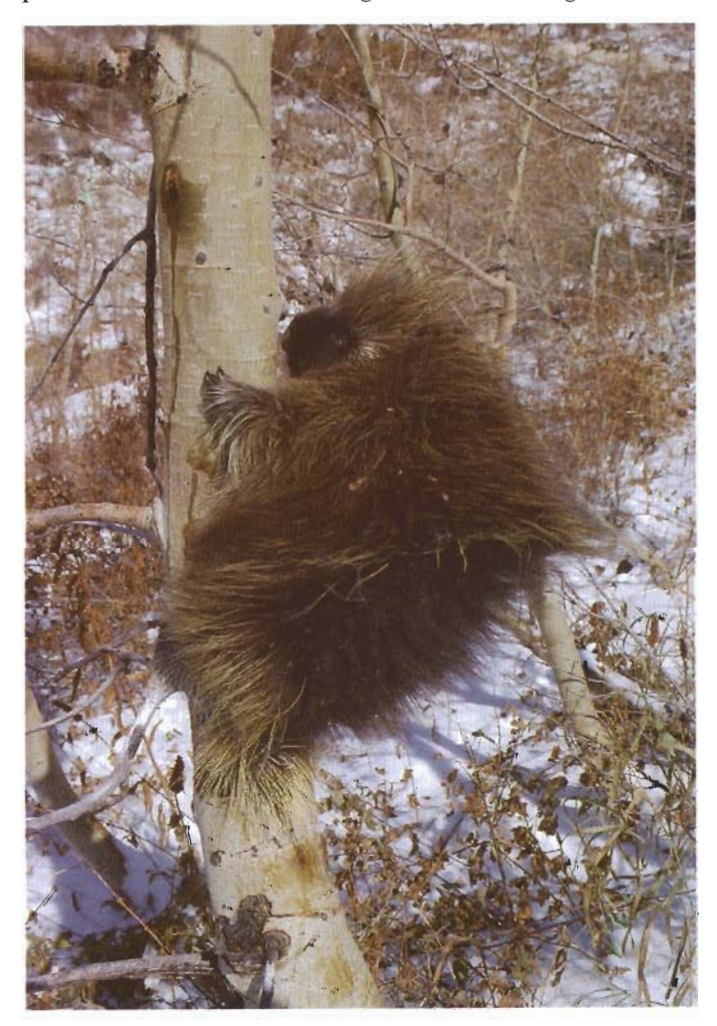
Figure 12.—Porcupines feed on aspen and associated vegetation.

Although the pocket gopher is seldom seen, evidence of this fossorial rodent is present in most aspen stands. This evidence consists of small soil mounds that are pushed to the surface during summer feeding and bur-