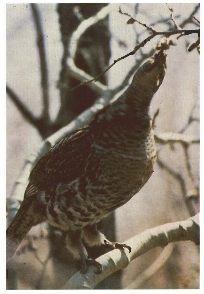
Figure 5.—Aspen floral buds are an important food for ruffed grouse.

Aspen buds alone are nutritious enough to support grouse during the winter (Svoboda and Gullion 1972), especially the staminate floral buds in the upper part of the canopy (Gullion and Svoboda 1972). However, willow buds contain a greater concentration of protein and carbohydrates but less fats than aspen in winter (Doerr et al. 1974), and rose hips are especially high in protein