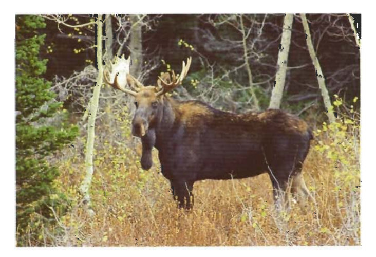
Figure 6.—The Shiras moose uses aspen and aspen-conifer forest cover extensively during all seasons of the year, in several western states.

Probably because of their tolerance for cold, moose will occupy willow bottoms without much thermal cover early in winter. But, as winter progresses and snowpacks deepen, they move into densely forested uplands