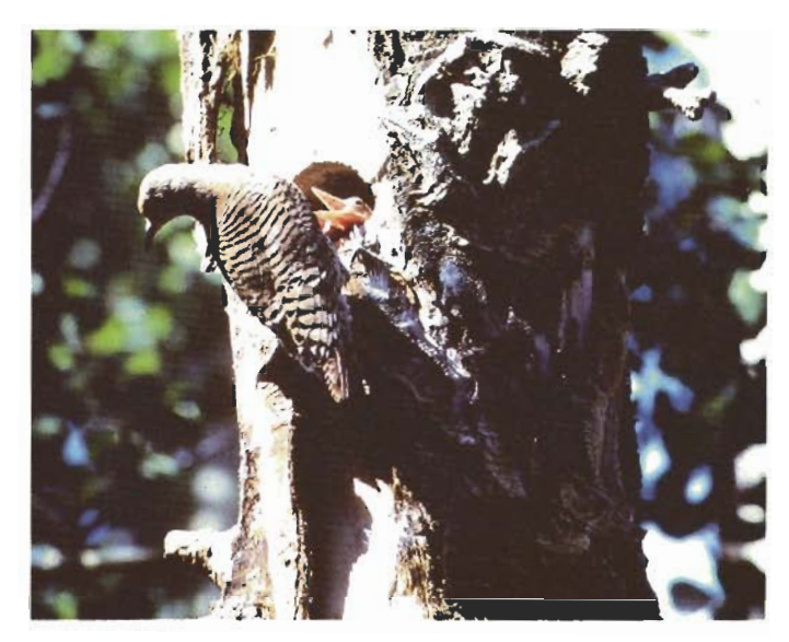
Figure 2.—The northern flicker is an important cavity builder in the aspen forest. It provides nest sites for itself and for the many secondary cavity nesting species that may follow.

Some 85 species of birds in North America use tree cavities for nesting; most of these are insectivorous (Scott et al. 1977). About 34 of these species nest in the cavities of aspen in the West. They include the waterfowl listed in the chapter appendix; the American kestrel and merlin; the flammulated, western screech, northern pygmy, and northern saw-whet owls; all of the sapsuckers and woodpeckers in the chapter appendix; the western and great crested flycatchers; the purple martin; the tree and violet-green swallows; all of the chickadees and nuthatches listed in the chapter appen-