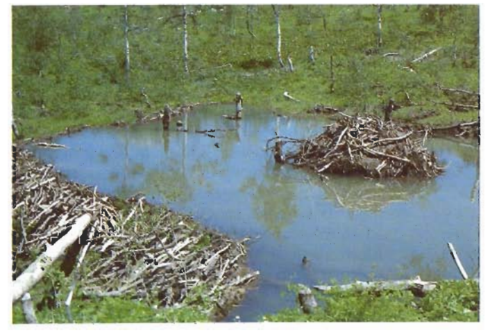
Figure 10.—A beaver dam and lodge in the pure aspen forest type, along a stream in Utah's mountains.

Beaver will cut any diameter aspen available (fig. 11), although they seem to have a slight preference for the 2-inch (5-cm) size class (Hall 1960). About 2–4 pounds (1-2 kg) of bark is eaten each day by a mature beaver, most of which comes from branches and boles less than 3-4 inches (8-10 cm) diameter (Hall 1960, Stegeman