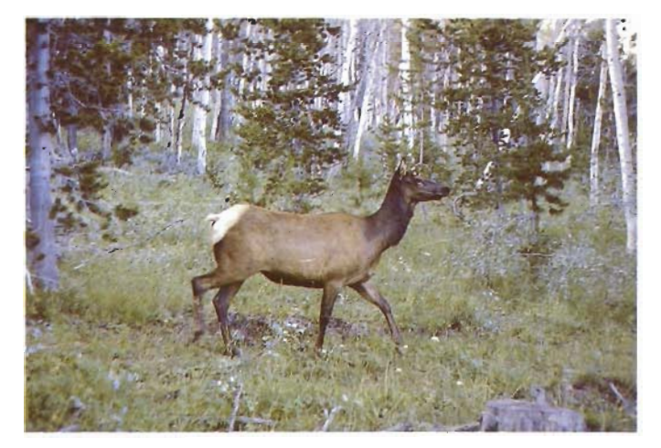
Figure 7.—Elk are an important resource in the aspen forest type in the Rocky Mountain West.

An aspen understory rich in forbs and grasses provides excellent quality elk feed in large quantities during the summer and early fall seasons (see the FORAGE chapter). During those seasons the aspen provides cover as well. In fall and winter, if the elk remain in the aspen zone, they will browse aspen to a height of approximately 6 feet (2 m) and will chew the bark from mature aspen trees (see the ANIMAL IMPACTS chapter). Dense