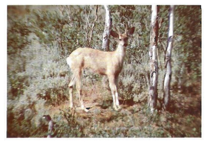
Figure 8.—In the West, mule deer are the most common big game inhabiting the aspen forest type.

The quality of forage taken from the aspen type by deer and elk is quite high, especially in summer. The mix taken by deer and elk in Utah during the growing season was about 65% digestible and contained 13% protein (Pallesen 1979). Protein contents of 21% for deer diets and 18% for elk diets on an aspen dominated site were measured in a later study (Collins and Urness 1983). Some shrubs in the aspen type are very nutritious. For