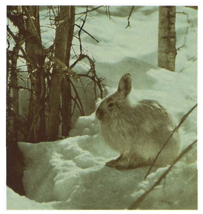
Figure 9.—Aspen stands with an appreciable conifer component provide snowshoe hares with satisfactory habitat, even in winter, when deep snow buries much of the understory cover and food.

<sup>6</sup>McCulloch, Clay Y. 1982. Evaluation of summer deer habitat on the Kaibab Plateau. Final Report, Arizona Game and Fish Department, Project W-78-R, 20 p. [Typescript]