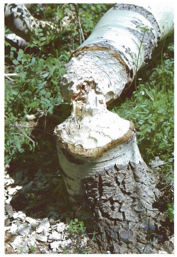
Figure 11.—An 8-inch diameter aspen felled by beavers during the previous week. The bark and twigs were eaten, and some branches were removed and used in the nearby lodge and dam.

1954). Stegeman (1954) found that the degree of utilization varied from 98% on 3/4- to 1-inch (2- to 3-cm) trees to 64% on trees larger than 8 inches (20 cm) diameter. The small trees produced only about 2 pounds (1 kg) of food, whereas 10-inch (25-cm) diameter trees produced 220 pounds (100 kg) of beaver food. He estimated that 1,500 pounds (700 kg) of aspen food is required per beaver per year. In summer beavers feed on succulents, too. Tree cutting and food cache construction by beaver reaches a peak in autumn (Hall 1960). Banfield (1977) estimated that about 200 aspen trees would support one beaver for 1 year.