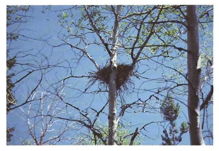
Figure 3.—An active northern goshawk nest in a mixed aspenconifer stand in western Wyoming.

Most raptors and owls will nest in the aspen type. The golden eagle, and the peregrine and prairie falcons are