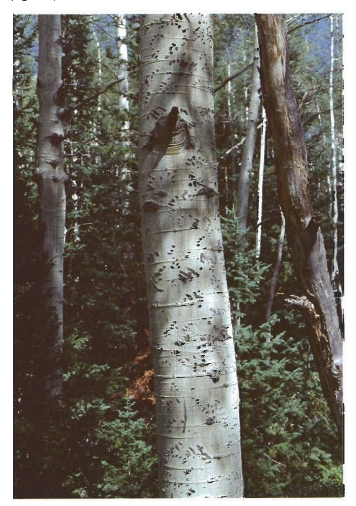
Figure 13.—Black bears eat aspen buds and catkins, as is evident from the repeated climbing of this aspen tree in northern Colorado.

Other animals in this group are omnivores; they may be as dependent upon the vegetation as they are upon a prey base for a food supply. The largest among these are bears. Black bears in Alberta, for example, prefer aspen, aspen-birch, and jack pine forests in summer and fall, presumably because of an abundance of berries in the deciduous forested uplands. Because they den near their fall feeding sites, most of the dens are also in the aspen and aspen-mixed stands (Fuller and Keith 1980, Tietje and Ruff 1980). Gullion (1977b) cited accounts of black bears feeding on aspen buds, leaves, and catkins (fig. 13). In Colorado and in Idaho, DeWeese and