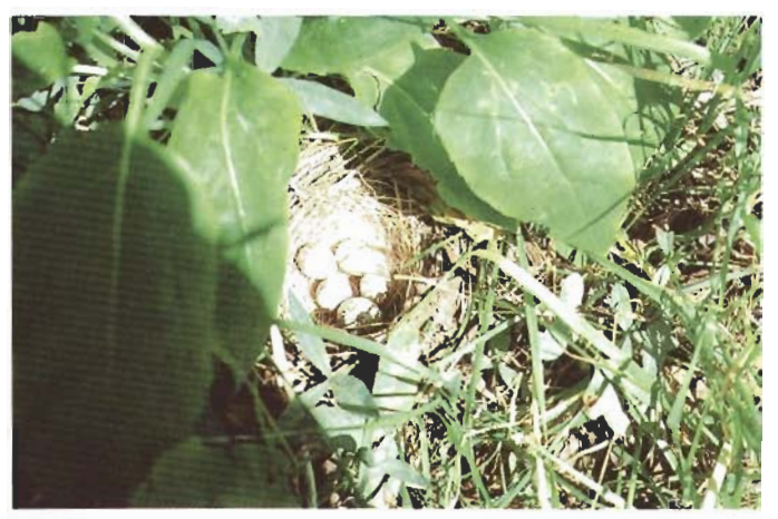
Figure 1.—Several bird species nest on the ground beneath the aspen canopy. An example is this dark-eyed junco nest beneath the herbaceous understory of a pure aspen stand in Wyoming.

Shrub nesting bird species include the Empidonax flycatchers; rose-breasted and black-headed grosbeaks; chipping, clay-colored, and song sparrows; yellow and MacGillivray's warblers; lazuli bunting; rufous-sided and green-tailed towhees, black-billed cuckoo; and