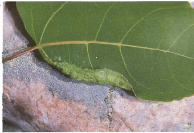
Figure 6.—Common sawfly larvae (A) are not always readily visible because (B) they commonly are found in folded leaf edges.