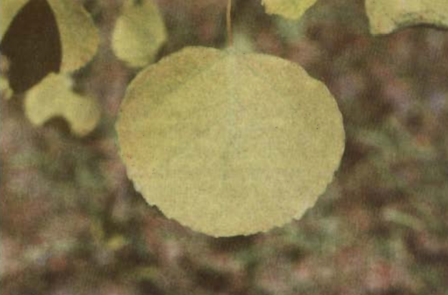
Figure 8.— Yellow spots on aspen leaves (A) are caused by sucking insects. If leafhopper nymphs extensively feed on aspen, the entire leaf may turn yellow (B).