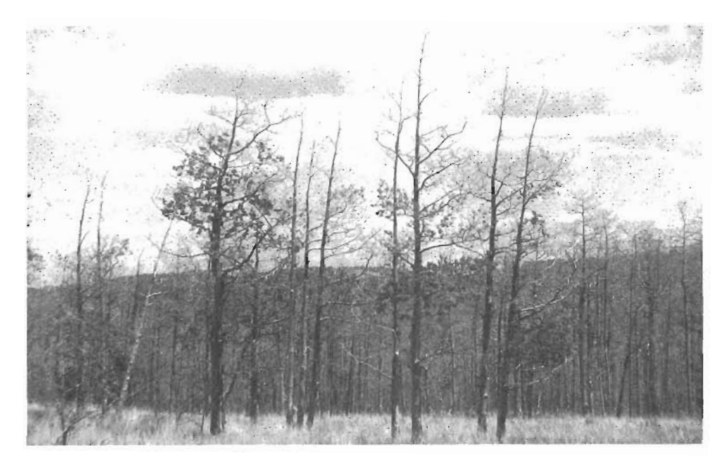
Figure 4.—Deteriorating aspen stand 1 year after collapse of a western tent caterpillar infestation. The stand had been completely defoliated for three consecutive years (Stelzer 1968).

(Smith and Raske 1968). Also, parasitic and predatory insects kill eggs, larvae, and pupae of the western tent caterpillar; but heavy parasitism has not been reported (Stelzer 1968) and, therefore, does not appear to be an effective control either. Instead, buildup of a nuclear polyhedrosis virus, specific to tent caterpillars, appears to be the key factor responsible for collapsing outbreaks (Clark 1955, 1958; Stelzer 1965, 1968). In each reported instance, it took several years for this virus to naturally reach effective levels in the major outbreak areas.