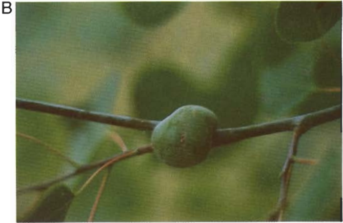
Figure 2.—Some insects leave obvious evidence of their presence. Their feeding causes some abnormal plant growth that results in galls. (A) Leaf gall. (B) Branch gall.

in the West. Its known range extends from Mexico to Washington (fig. 3). This species contains six subspecies (Furniss and Carolin 1977). One of these, M. c. fragile (Stretch), which formerly had species status, is commonly known as the Great Basin tent caterpillar. This subspecies is most damaging to aspen in the interior West. Another subspecies, M. c. pluviale (Dyar), the northern tent caterpillar, feeds on aspen through much of Canada. It also occurs in northern Idaho and western Montana (Stehr and Cook 1968), but has not been a serious aspen pest in the United States.