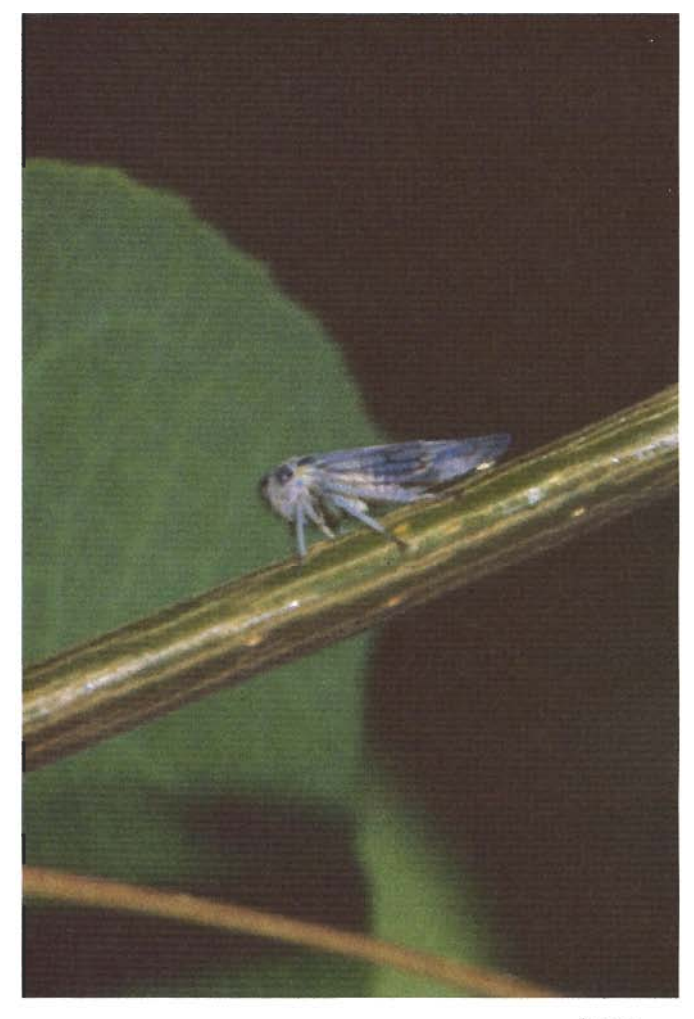
Figure 7.-Idocerus probably is the most common leafhopper on aspen.

readily can be distinguished from Lepidoptera caterpillars by their more than five pairs of fleshy legs.