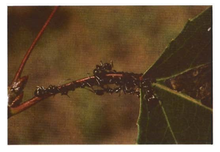
Figure 9.--Ants often are found tending aphids on aspen.

<sup>a</sup>U.S. Department of Agriculture, Forest Service. 1962. Timber management guide for aspen. 14 p. U.S. Department of Agriculture, Forest Service, Rocky Mountain Region, Denver, Colo.